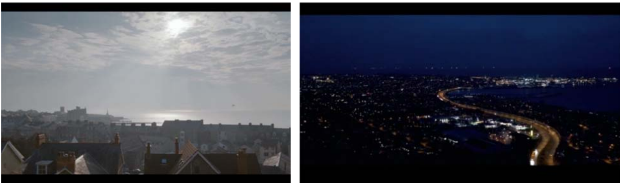
Translocal images from Hinterland S1:E2 8:50 (left) and Norskov S1:E1 0:13 (right).

Let me start out with showing you two images from two different TV-series. The first is from the recent Welsh BBC-production Hinterland (2013) and the next image is from the very fresh Danish Nordic noir TV-drama Norskov , which premiered last week on the Danish commercial public service channel TV2: