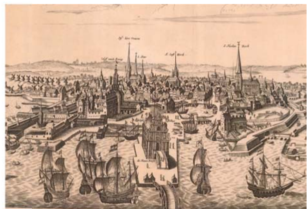
Four panoramic maps of popular cities: Quibec (1755), London (1845), St. Louis (1859), Copenhagen (1640)