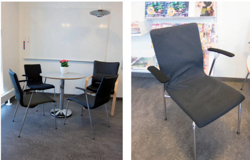
Figure 1. Illustration of the armrest where five different surfaces were installed during the test study.

As the purpose of this study is to conduct an in situ test on the cleaning potential of \text{SiO}_2 -coated textiles in hospital interiors, the specific premises for the study should be in continuous use during the day to increase the necessity for cleaning. Therefore, a demarcated waiting room at the outpatient lung department, Sygehus Vendsyssel (Hospital Vendsyssel), Hjørring, Denmark, was settled as the specific context. To represent the “worse-case-scenario” of upholsteries, the different textiles were installed on the armrest of existing hospital chairs (Figure 1). Here the patients’ hands are in direct contact with the chairs, which constitute the greatest risk of cross-contamination. The specific premises offered a broad patient mix