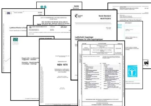
Figure 1 – Classification schemes in Europe are published by national standardization organizations since the 1990es. Only in Germany, schemes have been published by "private" organizations. An overview of schemes is found in Table 1.

Comparative studies of regulatory sound insulation requirements in Europe [1,2] and acoustic classification schemes [3] show that sound insulation descriptors, regulatory requirements and classification schemes in Europe represent a high degree of diversity. Regulatory sound insulation requirements for dwellings exist in more than 30 countries in Europe. Classification schemes exist in several countries. In some countries, sound insulation requirements have existed since the 1950s. The first classification schemes for dwellings were implemented in the early 1990s. The studies conclude that harmonization is needed for descriptors and sound insulation classes to facilitate exchange of data and experience between countries and to reduce trade barriers.