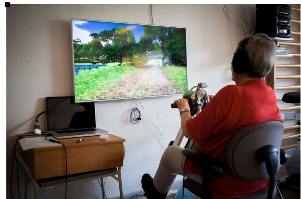
Figure 3: Subject exercising using the VE augmentation

All items were thus designed for qualitative data, to increase the chance of useful information and chance of catching misinterpretations. Some items initially required closed yes/no answers, which would always be followed by the request of a qualitative elaboration.