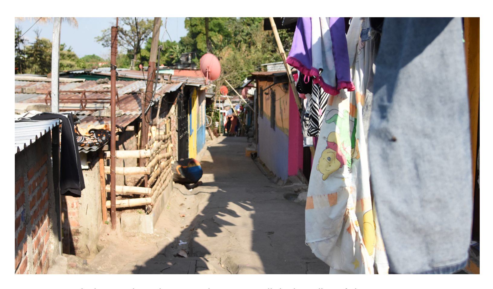
Figure 1. Laundry hangs to dry in the street in the gang-controlled urban village of El Tanque, in San Salvador, El Salvador.