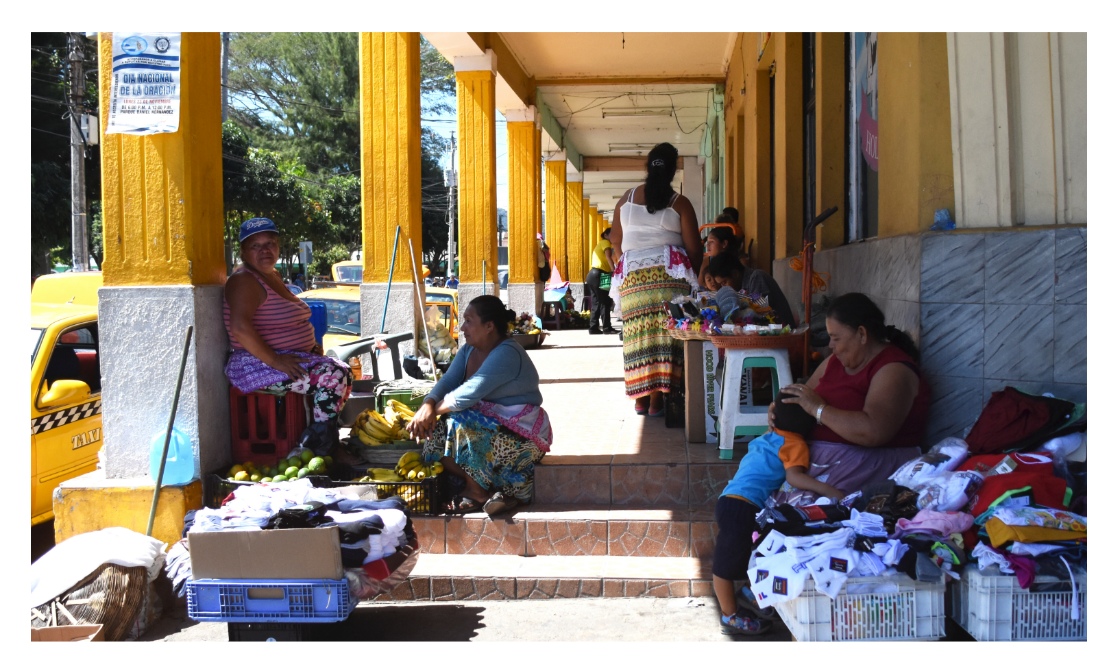
Figure 8. Women and children sell fruit and bundles of socks on the sidewalk in Santa Ana, El Salvador. With minimum wage at just above $1, many people take to the streets selling small items in hopes to turn a profit. Children of all ages accompany their guardians in the street markets.