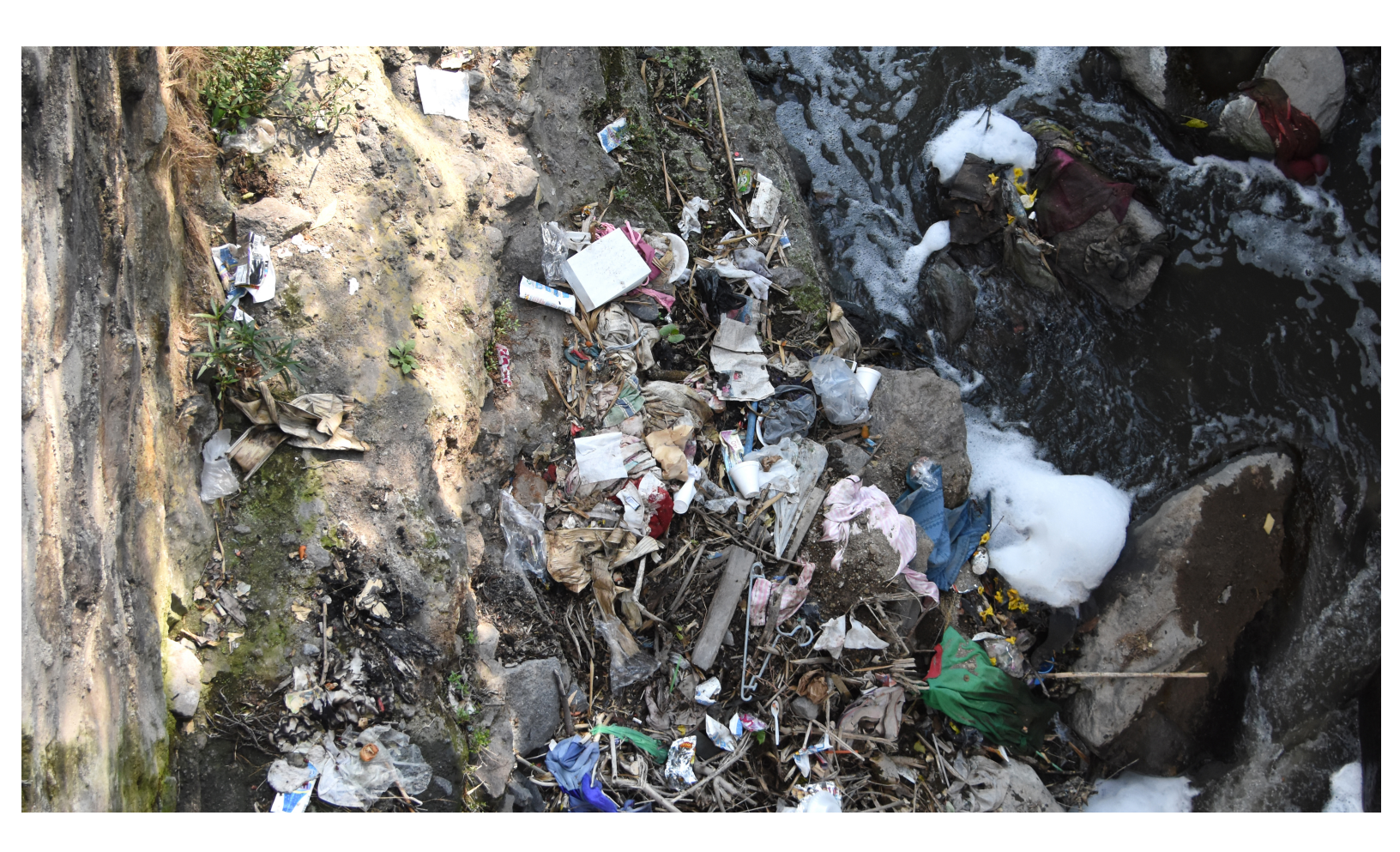
Figure 2. Trash lines the river bank that flows through the urban village of El Tanque in San Salvador, El Salvador. The unclean drinking water, combined with a lack of running water in most homes results in a majority of the population having water delivered in 5 gallon jugs.