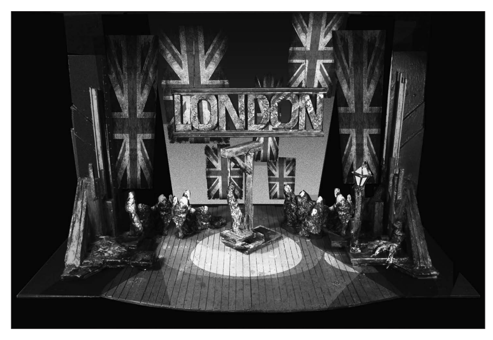
FIGURE 2. The same model photograph appears here with Payne's digital enhancements showing added scenery, lighting effects, and human figures.