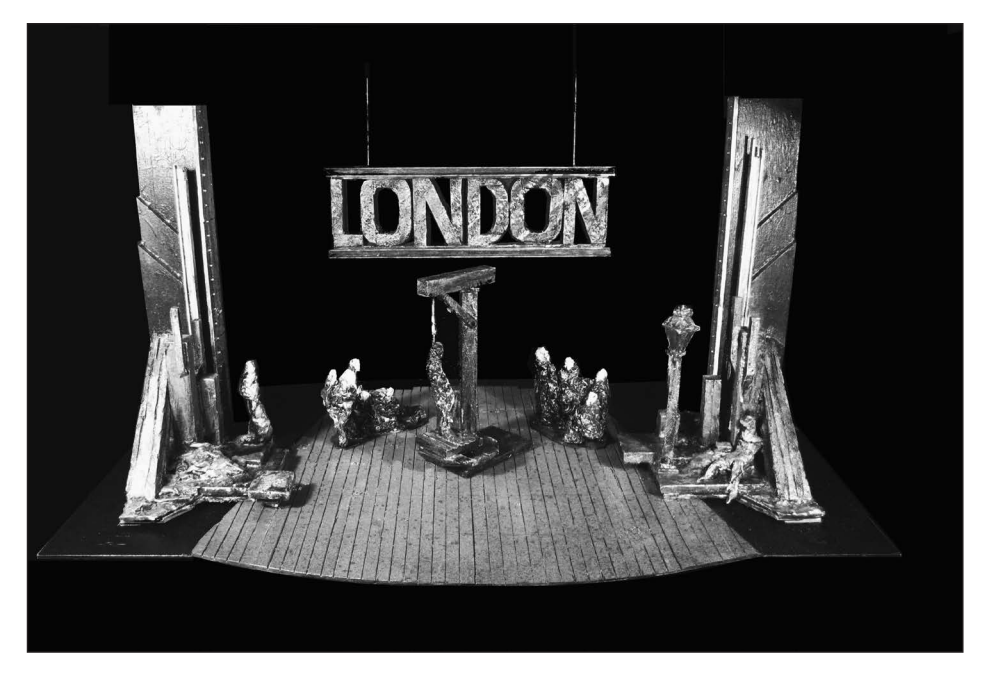
FIGURE 1. A stage configuration created by Darwin Reid Payne for a 1987 production of The Three Penny Opera is shown in this unedited model photograph.

information for both the physical collection and digital surrogates, and adhere to digitization best practices to provide users reliable and trustworthy records. The student worker scanned or photographed the items to preservation standards and created access copies, adjusting color in Photoshop to most accurately render the analog materials digitally. Indeed, the Illinois State Library best practices for digital imaging state: "Create a faithful reproduction of the original. So as not to diminish the historical, cultural accuracy and value of the material, don't attempt to correct or improve the original content." Similar guidelines in government and higher education reinforce this practice.