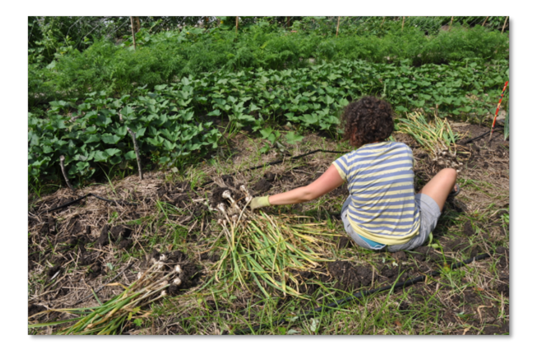
Figure 6: Harvesting garlic.