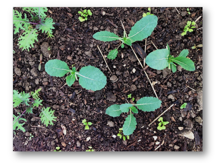
Figure 4: Interplanting kale and arugula.

I sow seeds directly in the garden and start seedlings under lights in my basement and in a cold frame outside; a year-round, all-over process. The seedlings that come up in the cold frame serve as my palette from which I pull materials to interplant among others as they come up in situ or are removed. It is similar to composing a collage – mixing and matching, establishing comparisons and contrasts, moving and gluing (Figure 4). While I do much of my farm work with family and friends, determining where and when to move plants around is something I do on my own. It is a responsive exercise that requires me to observe the present and imagine the future.