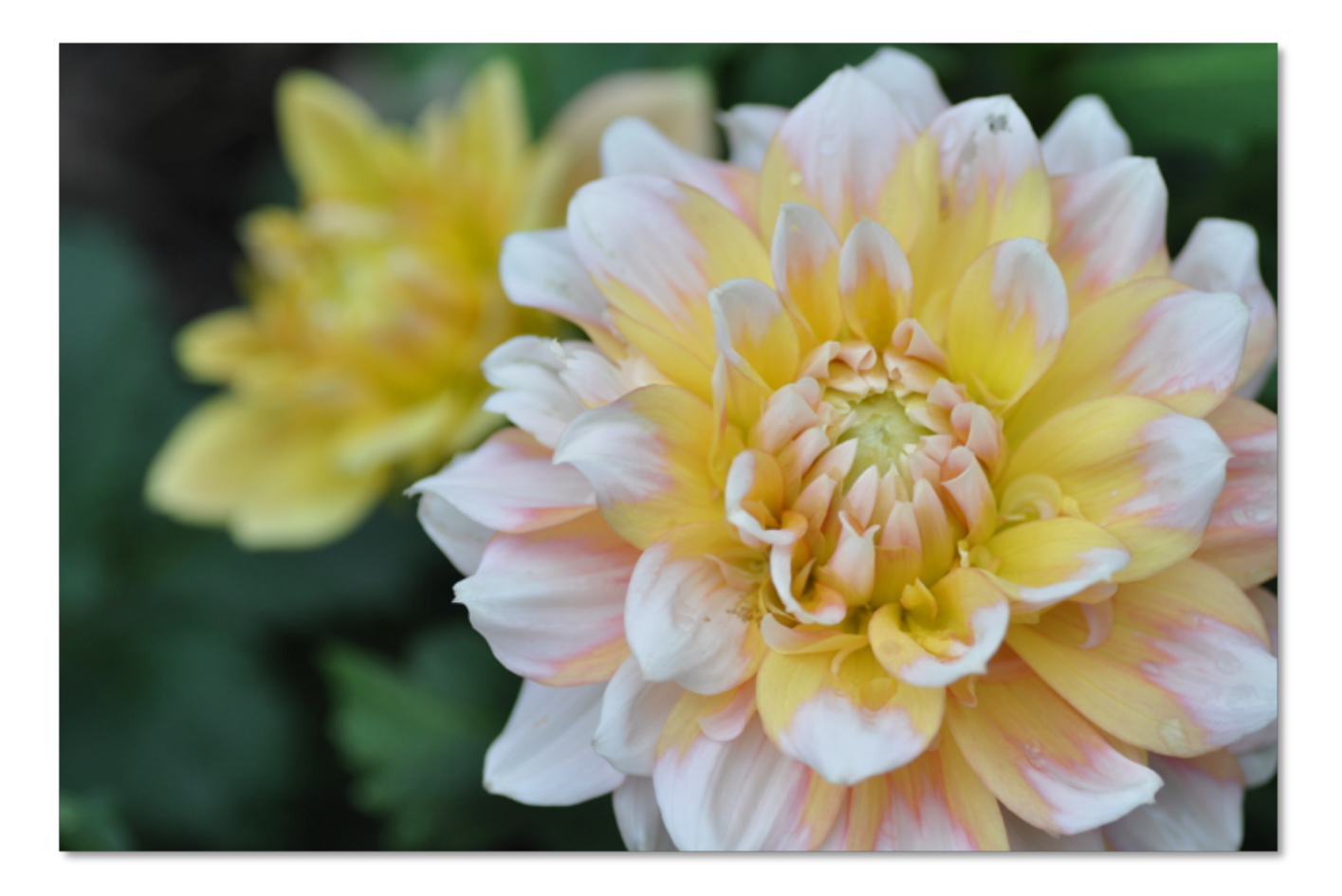
Figure 9: Dahlias and depth of field.

Our social media campaign also helps to extend the goals of the project beyond our CSA community by raising awareness about organic farming methods, sharing details about the production of our crops, and offering practical advice for others interested in such endeavors. We attract followers across the globe. It has also helped me connect with others in Columbus doing similar work. As a result, I have become part of a network of urban farmers in Columbus who provide opportunities for others to grow and distribute fresh produce—all within a few square miles of my home. We are delivering hyper-local produce infused with compelling and meaningful narratives.