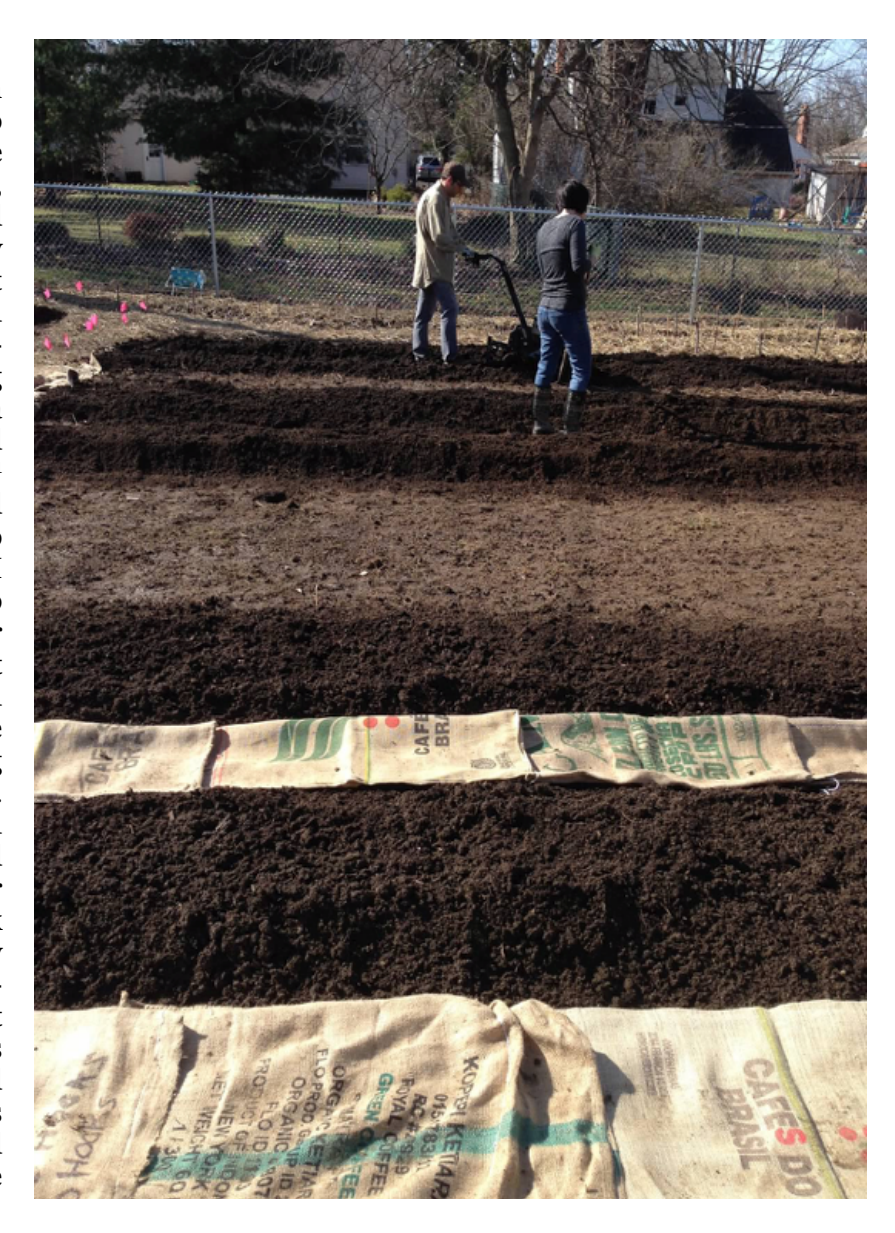
Figure 3: The transformation begins; compost tilled into bare earth.

Over the Fence is an experimental urban microfarm, a place to practice small-scale organic agriculture, creative placemaking, and participatory environmental art education. Friends and family operate as a looseknit cooperative providing financial support through a community supported agriculture (CSA) 1 arrangement and volunteering their time to help with farm chores. I continue to learn and to share techniques for growing produce that promote self-reliance and sustainability, both in the field and through a blog (overthefenceurbanfarm.com). Together we've created and maintain a peaceful and vibrant space in our community. It is work deeply rooted in my interests in sociallyengaged and relational art that actively engages audience members and educational initiatives which address real-world issues in the world we share.