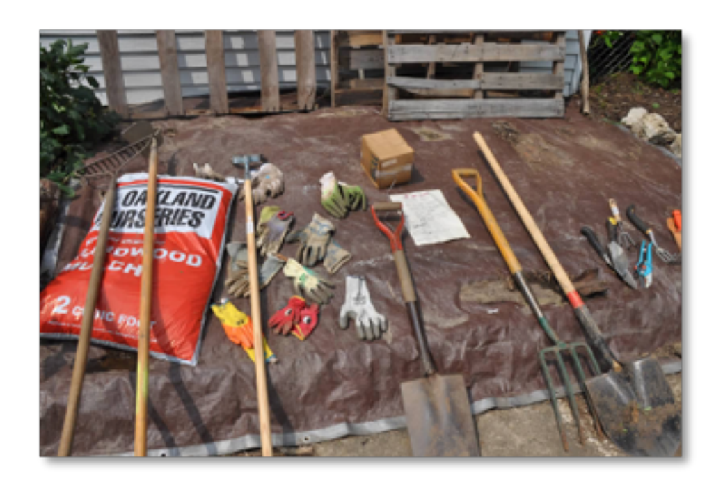
Figure 7: (Top) Tools and task lists prepared in advance of a CSA work session. Figure 8: (Bottom) Sharing life lessons while trimming and sorting the garlic.

creatively rewarding (Figures 9 and 10), and is a space to share extended, deep thoughts about the process of farming with friends.