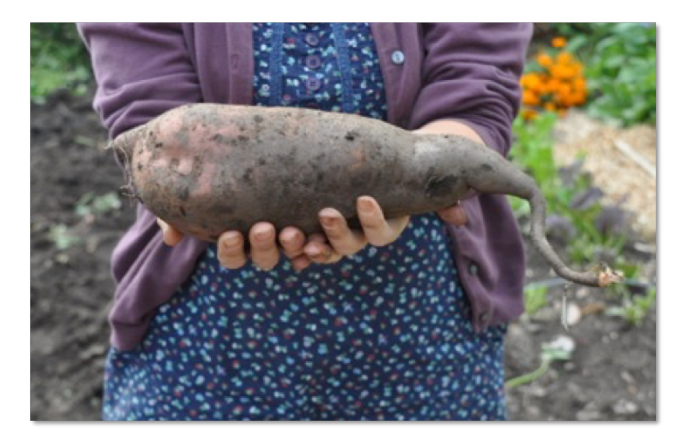
Figure 11: Prize-winning sweet potato.

sculpture that continues to evolve. And, like art galleries I've visited around the world, it is a "special" place (Dissanyake, 1990), a sacred space.