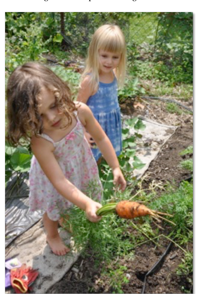
Figure 5: Pulling root vegetables offers an element of surprise.

Friedrich Frobel recognized this quality in children 150 years ago and named his education program for young children Kindergarten, the garden of children, in response. The name at once poetic and metaphoric - the classroom and activities were designed to serve as an environment to support children's natural creative and mental development. But, it was also a direct outgrowth of his love and respect for the natural world as a significant site and inspiration for teaching and learning about the individual in society (Straunch-Nelson, 2012).