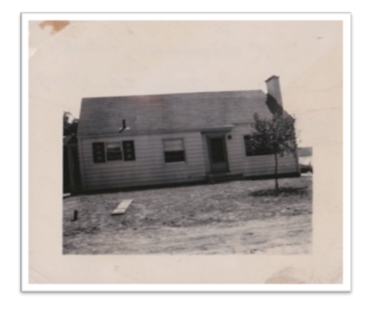
Figure 1: Move-in day, August 22, 1949

More than a decade ago I moved to Ohio to study art education at The Ohio State University (OSU). I never planned to stay here after graduation. As a fourth-generation New Yorker, I couldn't imagine life in the Midwest beyond my dissertation. For my first few years in town, I was a resident of OSU more so than Columbus. This was easy to do considering the university is so big it has its own zip code. Towards the end of my studies, I met a local man with a deep connection to the patch of land he lived on; the land we live on together today. Over time, our yard and the city that surrounds it, have become the context for some of the most authentic and profound experiences I have had as an artist and art educator to date.