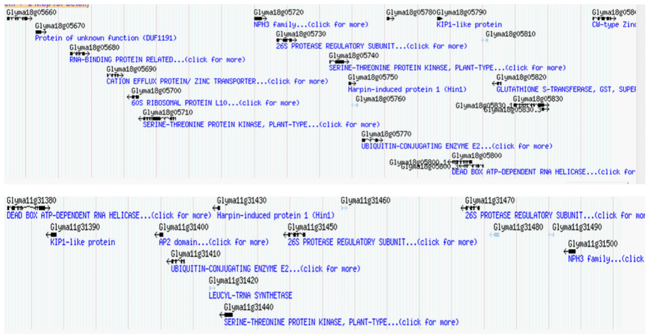
Figure 3. Genes flanking Rpt3 in the regions within 200kbp on chromosomes 11 and 18. Compare the common genes flanking Rpt3 genes on both the chromosomes.

QTL 17-4, 18-5 and 19-4. On linkage group G there was also a QTL for resistance to sudden death syndrome that overlaps the Rps3 genes and the SCN QTL