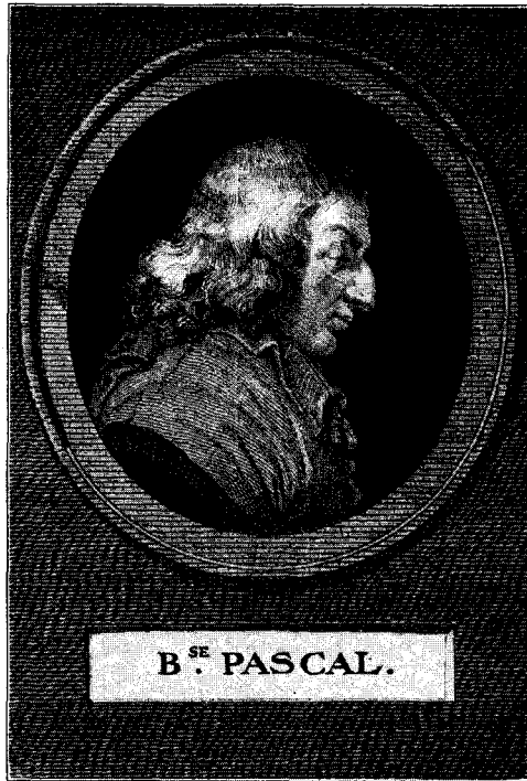
From an Engraving by St. Aubin of the bust of Pajou.

The parallelism (a genuinely Cartesian one) involves conclu-