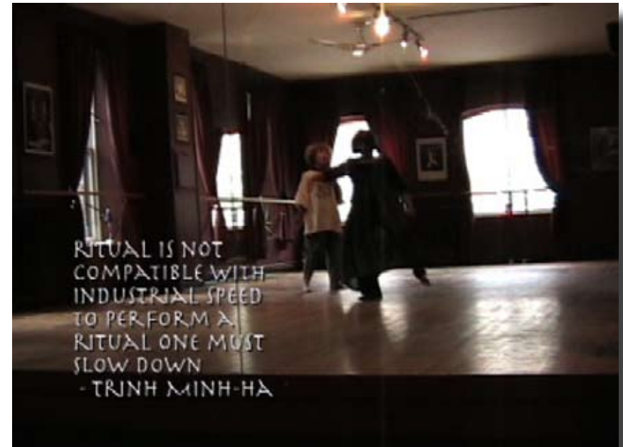
Figure 5: Bickel, Barbara. (2006). Re/Turning to Her video. Vancouver, BC: Forufera Studio. Video still.