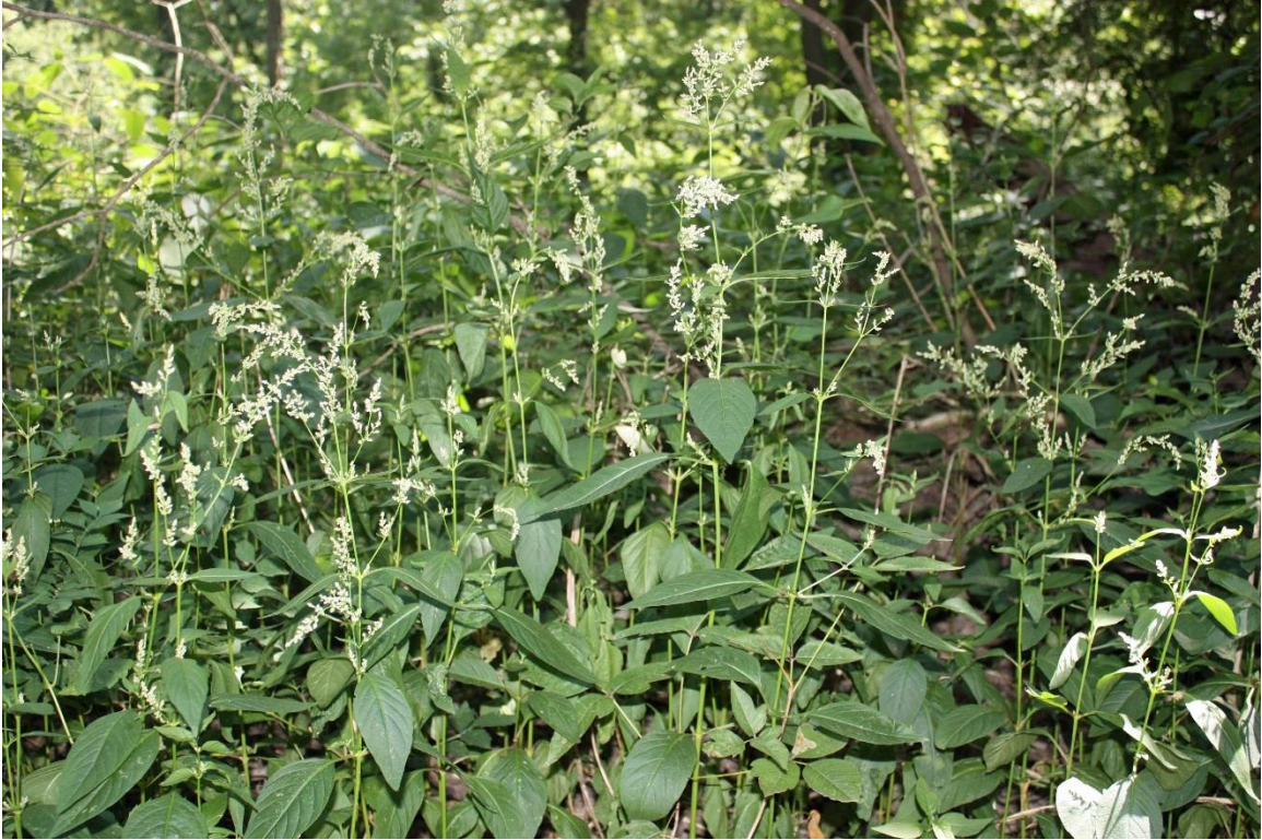
Photo 1. Flowering population of Iresine rhizomatosa at Beall Woods Nature Preserve. July 24, 2012.