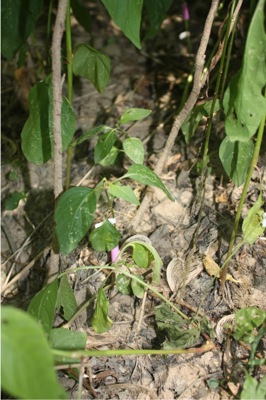
Photo 3. Tagged seedling of Iresine rhizomatosa at Beall Woods Nature Preserve. July 24, 2012.