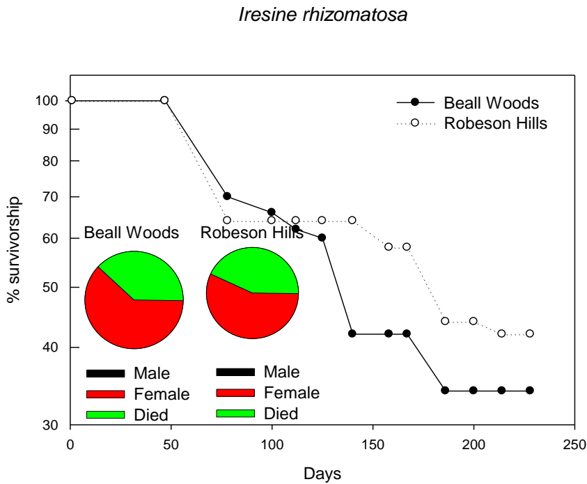
Figure 1. Survivorship of Iresine rhizomatosa seedlings emerging in 2012 through 230 days.

On average, male or female plants smaller than 50 cm in height produced 1 – 3 spikes; plants 50-100 cm produced 3-7 spikes for females and 2-5 for males; 100+ cm plants produced 5+ spikes for females and 3+ spikes for males (Table 1). Across sites, females produced more flowering spikes than male plants (female: 9 \pm 2 per plant; male: 5 \pm 3 ).