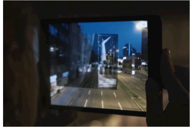
Figure 2. Bridge, an Open Sub-Experience