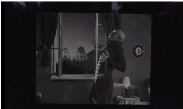
Figure 4. Nosferatu Dissolves into Ether

The settings were chosen to ‘physically’ place participants in a fictional universe by matching publicly and physically available objects (e.g., gravestones) or locations (e.g., an old bridge) to the fictional universe. By that, we created hybrid spaces (see [1]) combining virtual and physical environments to merge the fictional universe and the environment into one experience [22]. In addition, temporal aspects became important. Within the vampire genre, day and night standardly play significant roles for certain kinds of activities and we subsequently placed our experience around sunset.