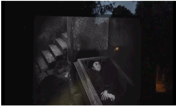
Figure 3. Nosferatu Rises and Attacks.