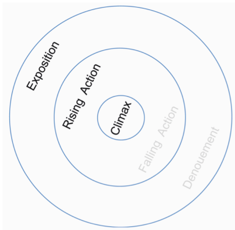
Figure 5. Non-Linear Storytelling based on Locations

test all possible paths for narrative logic and flow [5] in order to ensue a rich and meaningful holistic experience.