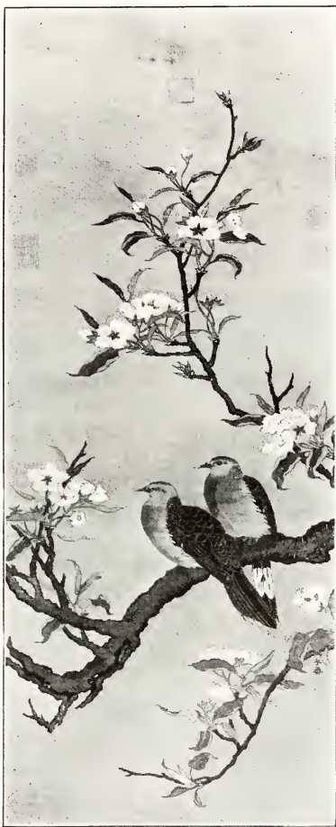
SILK TAPESTRY (K'Ō SSU)

Lent by the Chinese Government. These meticulously woven panels were often copied from paintings with such keen regard for the form and color that they could easily be mistaken for true paintings. This ascribed to the Sung Dynasty (960-1279) but is probably later.