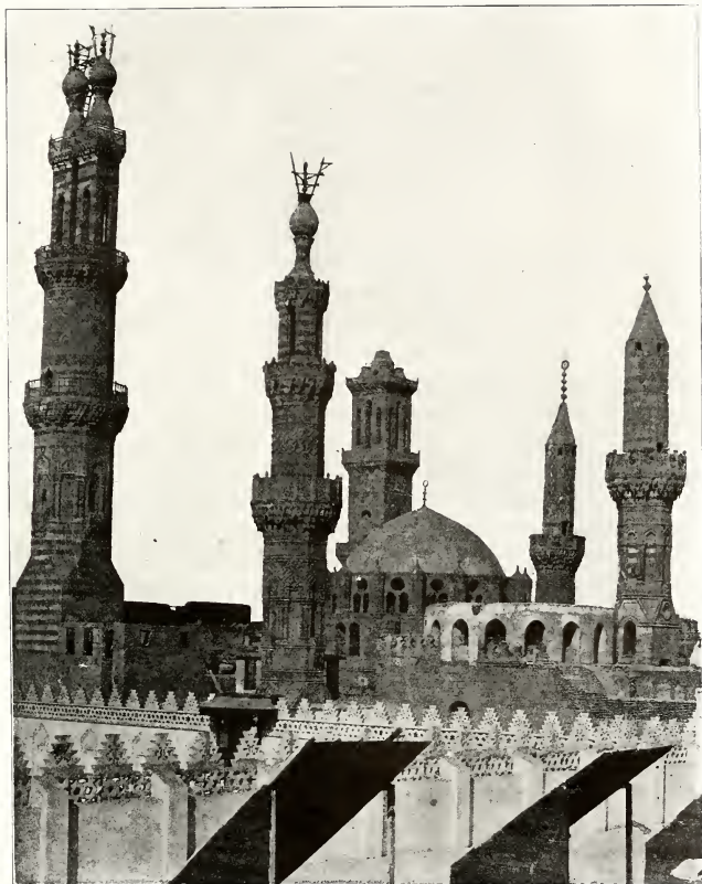
AL - AZHAR MOSQUE AND UNIVERSITY