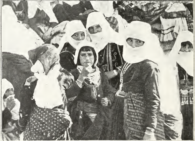
THE YOUNG WARRIORS DANCED AT THE WEDDING FEAST. THE DRUSE WOMEN WATCHED THE GAMES FROM THE SIDELINES.