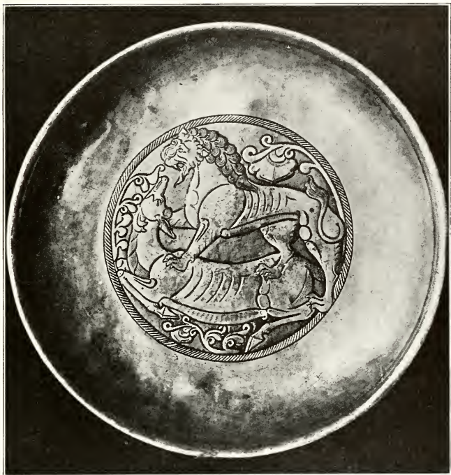
SILVER PLATE—SASANIAN

centers are given: for example, a circular or square basin is posed vertically at the foot of the panel, and a richly ornamented canopy is set obliquely, in the upper part, and all around there is a circling dance of objects and personages so arranged that the two spheres of action thus created are fused and by their persuasive poetry induce the eye to create a mobile perspective (for example, the beautiful scene of the presentation of the portrait of Khosru to Shirin, in the famous manuscript of the Shah Tahmasp period, painted between 1539 and 1543, illustrating the poems of Nizami which is in the British Museum).