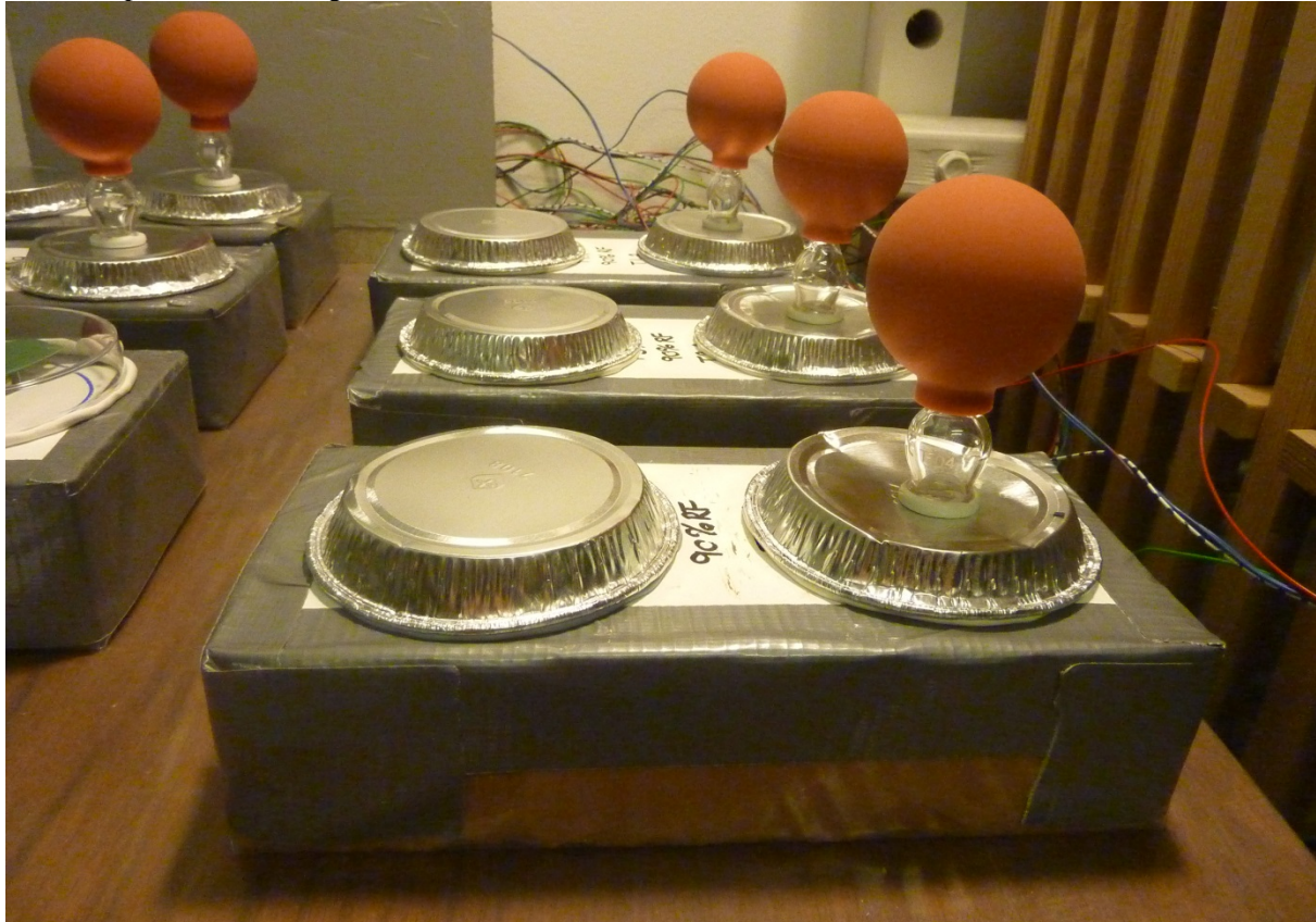
Figure 1. Experimental set-up showing moisture hoods sealed at the edge to the surface of bricks wrapped in PE-foil. Two experiments are conducted at the same time; one with under pressure (with suction device) and one without pressure difference.