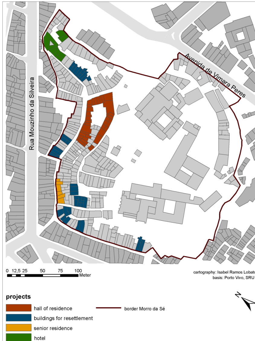
Figure 4: Urban regeneration projects in Morro da Sé

Besides these structural projects, numerous projects with a more immaterial approach are established in Morro da Sé. One of these projects is the so called “management of the urban area” (UGAU) which serves as a local approach similar to the English Town-Centre-Management. The UGAU shall mobilise companies, institutions and inhabitants and serves as a communication platform. Its main aim is the development and advancement of partnerships and networks as well as the promotion of economic and entrepreneurial activities (Porto Vivo SRU, 2008d: 7). Furthermore, an office for owner support was established. It shall give advice in terms of rehabilitation and supports owners to identify and apply for existing financial aid programmes for rehabilitation measures (Porto Vivo 2012). This office is part of the urban regeneration office which gives information about the regeneration process and current and planned projects within the ZIP to owners, inhabitants as well as other interested people.