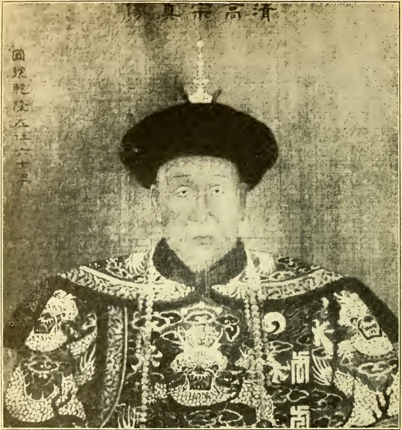
THE EMPEROR CH'EN LUNG

often comes to our house. On the 17th day of the 9th moon [Oct. 21] he arrived with the magistrate to investigate, and said that the Wen wai , or whatever you call it, by Ch'ü Ta-chün, is a rebellious and prohibited book. The district magistrate ordered your humble servant to hand it over. I got our family's copy and gave it to him to see. He took it and went off with it. Formerly, in the eighth year of Yung-cheng, at the time of the case in which the family of Ch'ü Ta-chün was accused of treason, my father was alive. Why this book was not given up then I truly do not know, but I declare that I have not wittingly kept it hidden."