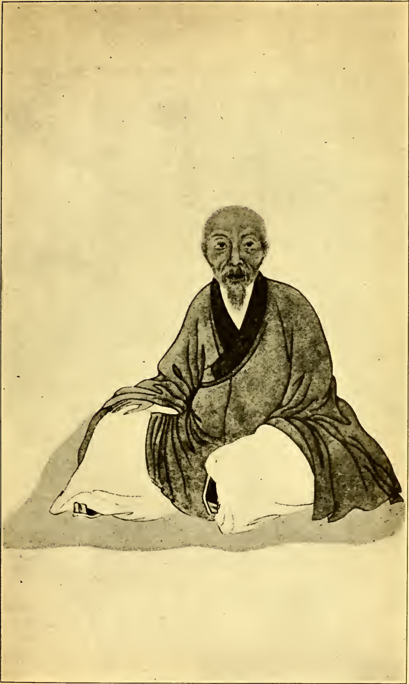
A PORTRAIT OF CH'Ü TA-CHÜN