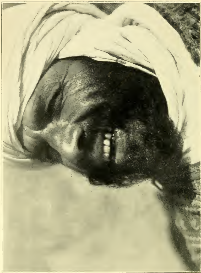
HADJE, PEDLAR OF BAGHDAD