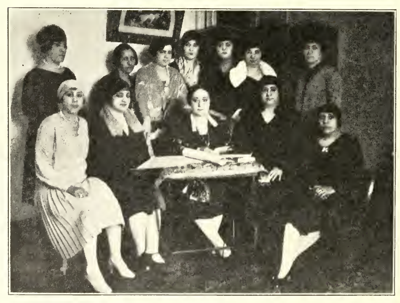
EXECUTIVE COMMITTEE OF THE EGYPTIAN FEMINIST UNION