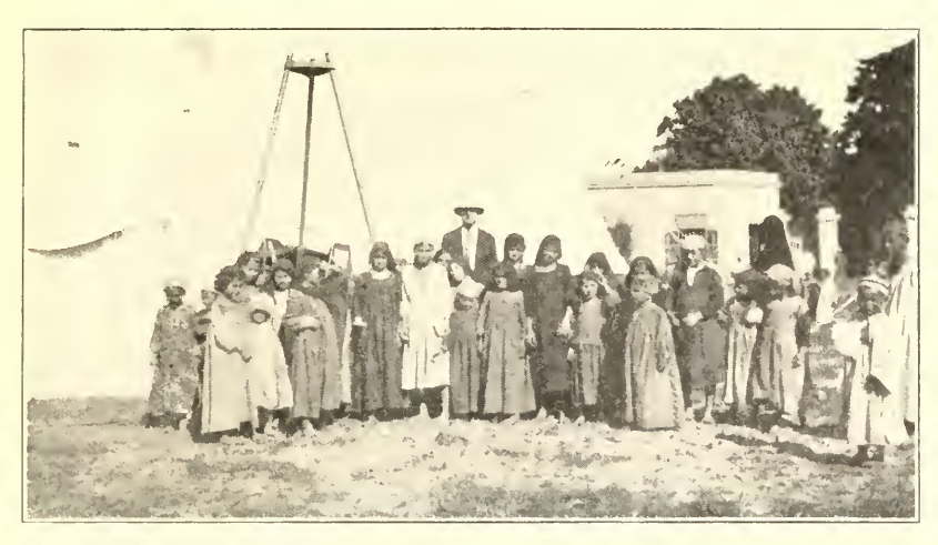
BILHARZIA PATIENTS A detention camp of Bilharzia patients of the Rockefeller Institute Expedition.

The fear which Lord Cromer, whose three-acre law is the Magna Carta of the Egyptian fellah, once expressed that "a freely elected Egyptian parliament....would not improbably legislate for the slave-owner, if not the slave-dealer," has been belied by time. Present and past Egyptian parliaments, in spite of numerous handicaps, have given good accounts of themselves. They have to their credit considerable social and economic legislation which has proved the progressiveness, far-sightedness, and loyal patriotism of the majority of representatives. Occasionally some of them have outlined legislative programs which would be considered advanced in any country. Thus in 1928 Dr. Abdul-Rahman Awad submitted a bill for the "betterment of the race," in which he boldly advocated the compulsory medical examination of couples seeking marriage.