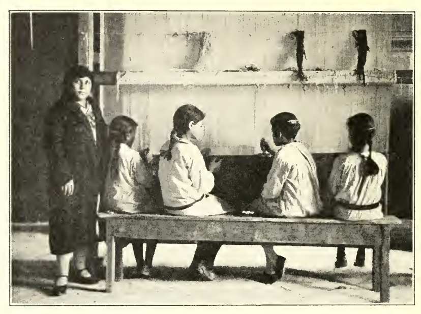
RUG WEAVING Instruction in Rug weaving under the auspices of the Egyptian Feminist Movement