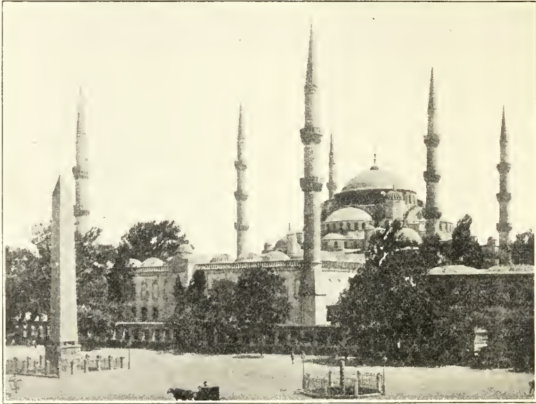
THE SULTAN AHMED MOSQUE IN STAMBOUL

venerable, Omar neither saw it nor had anything to do with it. Still it was constructed less than a century after the Arab conquest, which makes it just about 1200 years old. The Arabs were still pupils and beginners in the arts and crafts of settled civilization. This is, indeed, one of the first public buildings they attempted. If you look closely no doubt you can discover elements that are of Greek or Roman derivation. But look at it in its en-