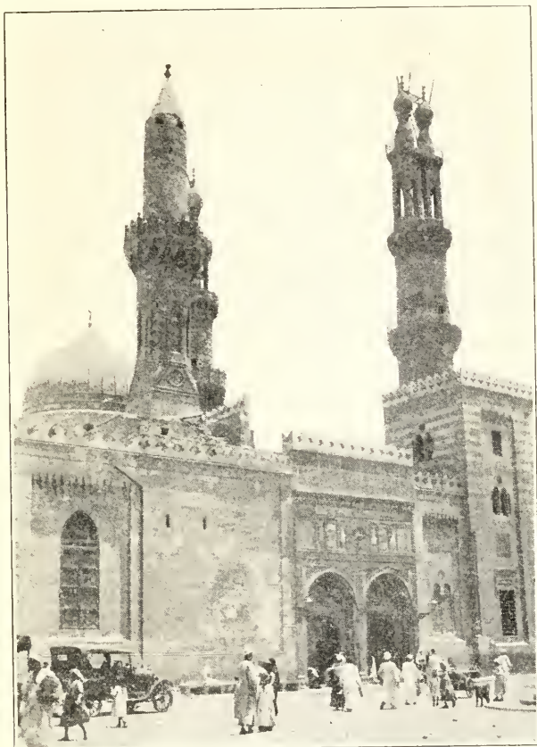
THE MOSQUE OF EL-AZHAR IN CAIRO

the complete story of their science and art. There are still among us Westerners those who do not see anything of worth before this modern day, except that which is Greece. To those who believe that Islam and its culture is nothing but a poor copy of things Greek