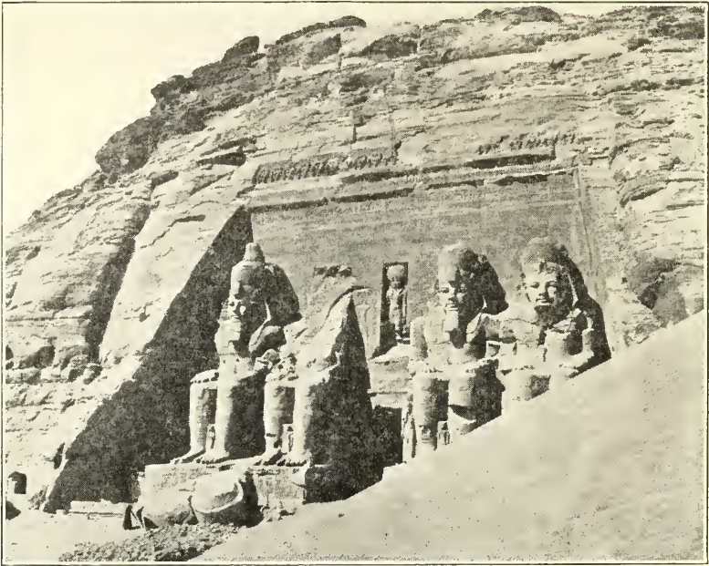
FACADE OF SUN-TEMPLE OF RAMSES II AT ABU SIMBEL (From Breasted: Temples of Lower Nubia )

lessly both bird and lotus in its blood-lust, while his lotus-bearing lady stands in soft and lacy attire close behind him to remind him, even in the savagery of the ordered chase, of his well-ordered, clean, comfortable and aesthetic home. And to complete the atmosphere of gracious homelife, his little daughter sits fearlessly beside him even as he flings his snake-shaped throw-stick. So early Egypt shows itself to us in intimate detail as it is at play within the narrow confines of its valley. We cannot show the color, though it may be seen in the Oriental Institute of the University of Chicago in Mrs. de Garvis Davies' excellent copy of the original which is now on exhibition in the British Museum.