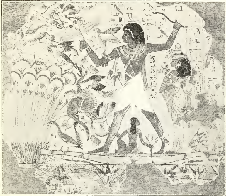
FISHING AND FOWLING SCENE IN EARLY EGYPT (From Mrs. Davies' copy of the original)

passed. Their rare moments of play and pleasure are registered in vivid color and in living detail on the walls of their abiding residence, the tomb. As their life is controlled by the conventions imposed by the narrow valley in which they live, so is their painting. Within the bounds of these conventions their art moves freely and with