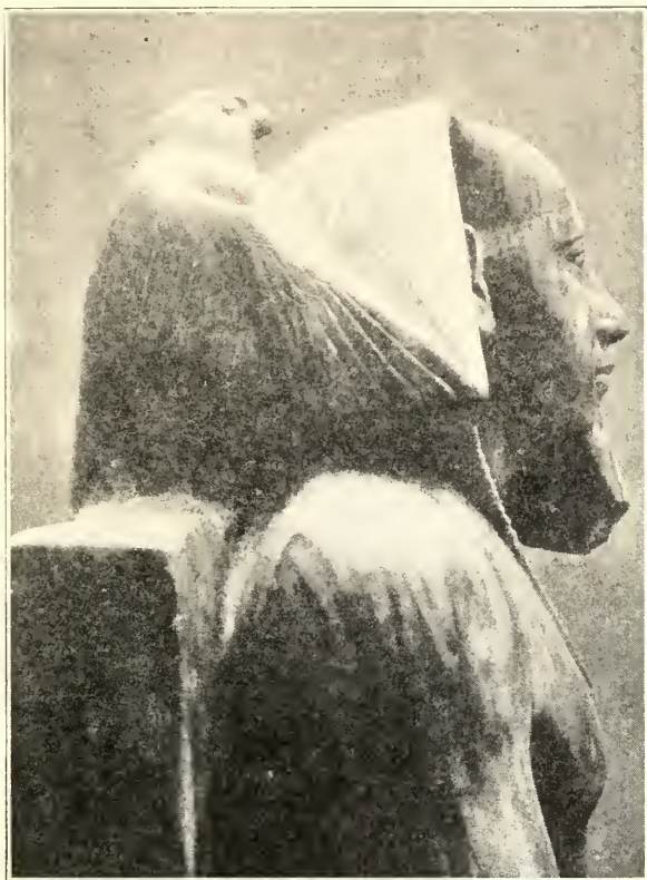
THE HEAD OF KHEPHREN (Cairo Museum)