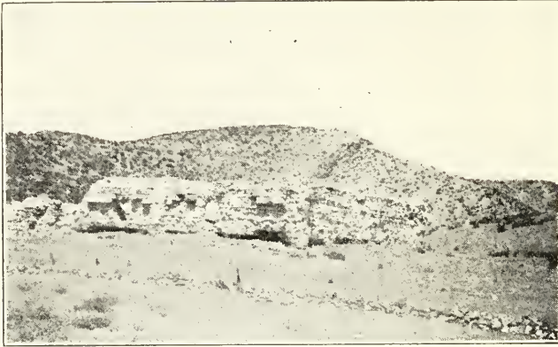
A DESERTED CARAVANSERIE

The machine age is upon them; it presses them with its speed; it changes the nature and the meaning of the water on their frontiers and of the soil under their feet; it awakens them, nomad as