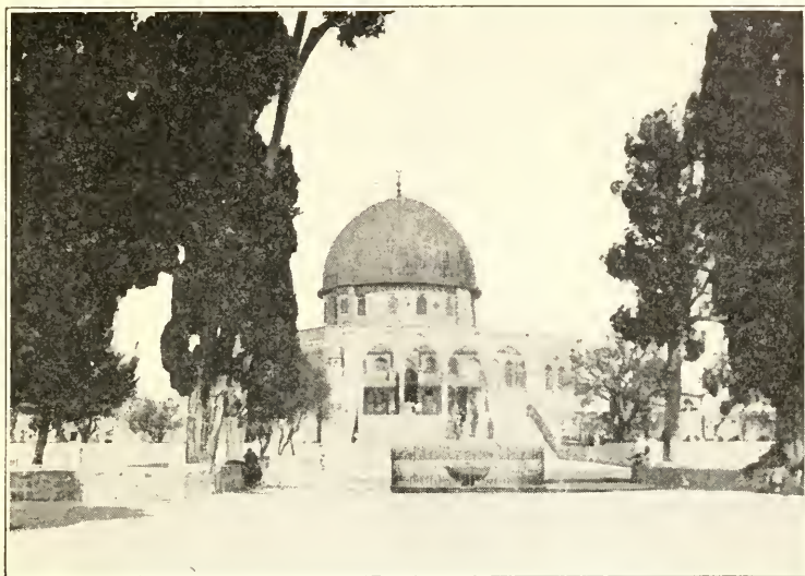
THE DOME OF THE ROCK AT JERUSALEM

ure and the heritage of the Western World, the indomitable spirit of the Nearer East withdrew into the heart of the Arabian desert, recreated there a kingdom of faith and hope in nomad style and with nomadic features. This is the Islam of the Arabs, and so aptly was it fashioned, that to this day throughout the length and breadth of Western Asia, wherever nomad sands and steppes prevail, there the Islam of Arabia's prophet, Mohammed, is the prevailing faith.