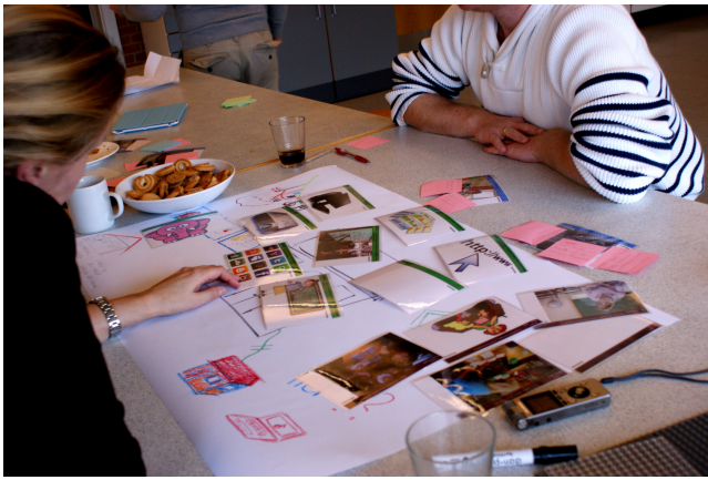
Figure 2. Inspirations cards and drawings ensured retention of externalizations on the future workshop.

In order to process this data we used a general inductive approach to label and categorize through open coding and abstraction [11]. Open coding involved reading through the transcripts several times whilst applying headings that would describe the content of sections of text. The headings were then put into separate coding sheets in which they were placed under higher order categories. This effectively resulted in a level of abstraction that made it possible to describe what each category represented. The result of this process was 37 labels across three generic categories (Table 1). The labels refer to topics and situations of designing teaching in each of their respective generic categories. By describing these generic categories, we describe our findings.