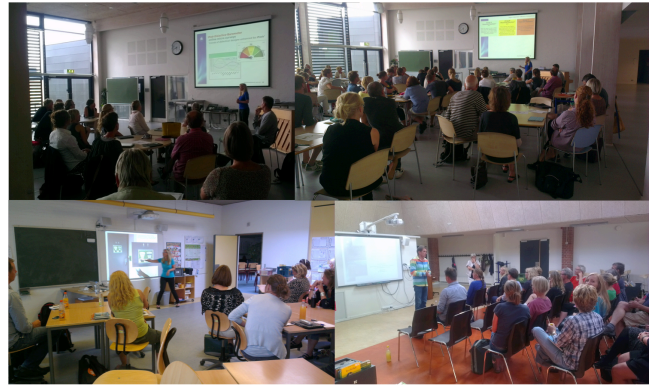
Figure 4. Discussing the results with the teachers.

c) The online survey, which regarded all teachers, comprised 22 items; closed questions on the teaching practice using media tablets. It was conducted in September 2013 and pre-tested in the summer of 2013. From a total of 170 teachers in Danish schools, the online survey was answered by n=148 teachers from all seven schools in the municipality, who started to use media tablets in January 2012. Some of the teachers skipped some questions. 85 were completed; response rate was 50.2 percent, 30 male and 70 female teachers. The teaching practice ranged from less than 1 year to 35 years (mean = 17-18 years; median: 16-17 years, standard-dev. 11). The results from the observations, the interviews, and the online survey, were presented and discussed with all of the teachers, see Fig. 4.