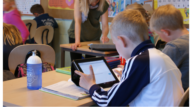
Figure 3. Young students working with media tablets.

teaching, and more specifically, situations in which the media tablet became a teaching tool and/or learning device [36] (Fig. 3).