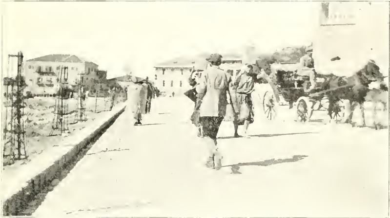
JERUSALEM'S LEADING STREET, JAFFA ROAD.

is acceptable to him." This discovery was of world-wide significance in its results. About a mile from the old town is the Russian settlement where the location of the house of Tabitha, or Dorcas is shown as well as her tomb. The spacious grounds are enclosed with a good wall and a substantial iron gate. But once inside one feels that its caretakers believe in order, cleanliness, and comfort. It is one of the bright spots of the city of Jaffa. Within its enclosure are orange, fig, and olive trees; vegetables and flowers; shady walks, tables and benches for those who may wish to enjoy a glass of tea in the open in the cool of the afternoon; rooms for pilgrims, and a fine church with a very tall steeple, or tower. The walls of this