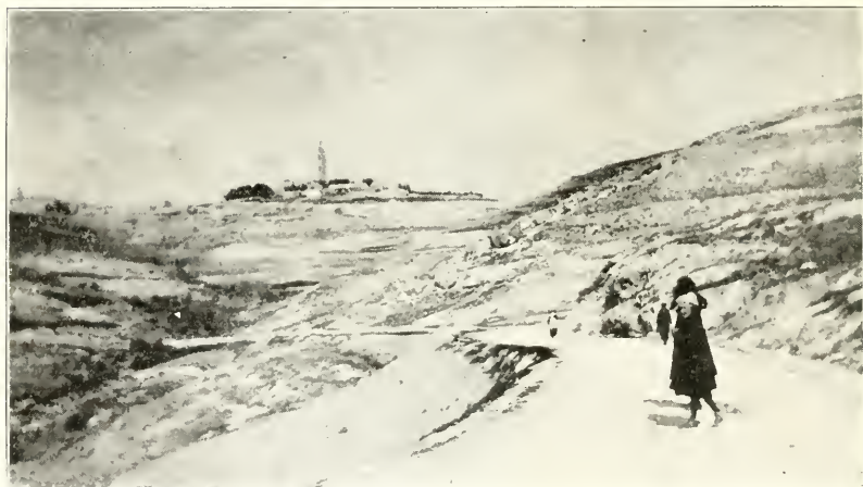
RUSSIAN TOWER ON MOUNT OF OLIVES FROM JANCHO ROAD.

cured from the peasants they despised. Her hosts of monks are in a semi-starving condition because they have not learned the art of useful toil. Their laziness was their undoing. Had these monks carried out the Apostolic injunction, "to do your own business, and to work with your hands, even as we charged you; that ye may walk becomingly toward them that are without, and may have need of nothing," they would today be independent of outside aid, have the respect of those who are without, have enough food and raiment for themselves and for their poor, and would have been a shining light of industry and thrift to their many followers. I suggested this to some of them and they were candid enough to admit the folly of their past life. Perhaps the fall of Russia may not be alto-