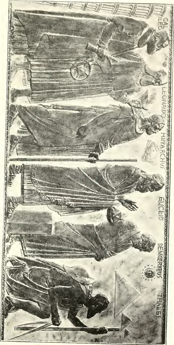
BRONZE WINDOW PANEL, SOUTH FRONT.