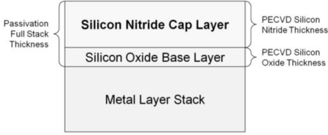
Fig. 1. Metal Passivation Layer Structure: Silicon Nitride cap layer and Silicon Oxide base layer, deposited in a PECVD process sequence for passivation of the underlying metal layer stack.

Relevant previous work comprises [6], in which the authors make use of the Monte Carlo simulation to enhance the Design of Experiment (DoE) data sets, and model the relation between the input variables and the output variable using a back propagation neural network. In [2], the authors propose to use a radial basis function neural network to model the dependence of the output variable on the input variable. However, the models are derived using process parameter data from real production equipment, instead of DoE data sets. Comparing a multiple linear regression model (using a stepwise procedure for selecting the input variables) with a multi-layer perceptron neural network and a radial basis function neural network is the focus of a study carried out in [7]. The authors of [8] use the multiple linear regression with stepwise selection in order to determine a set of input variables, which are in turn fed into a back propagation and a simple recurrent neural network model to predict the output variable. In [9] the data set is divided into an in-spec and an out-of-spec data set, and the Classification And Regression Tree (CART) is used to predict when a production wafer