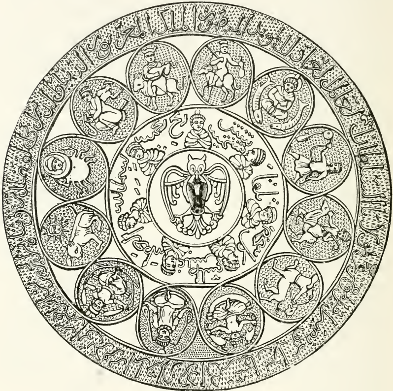
ANCIENT ARABIAN ZODIAC (13th Century)

having left their father Zebedee in the ship with the hired servants, they went after him." Matthew follows in substantially the same words, adding that Simon "is called Peter" (iv. 18-22), while Luke (v. 1-11) omits Andrew and combines the story of the call with that of the multitudinous draft of fishes—doubtless recognizing the possibility of a metaphorical application of both stories; which are certainly presented primarily as literal truth. Again, the story of Mark