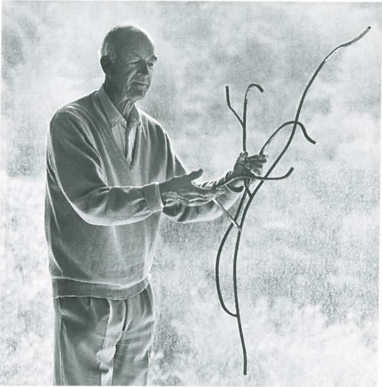
The essence of Danish architect Jørn Utzon's architecture is a fusion of form and structure inspired by nature and the visual universe of other cultures.