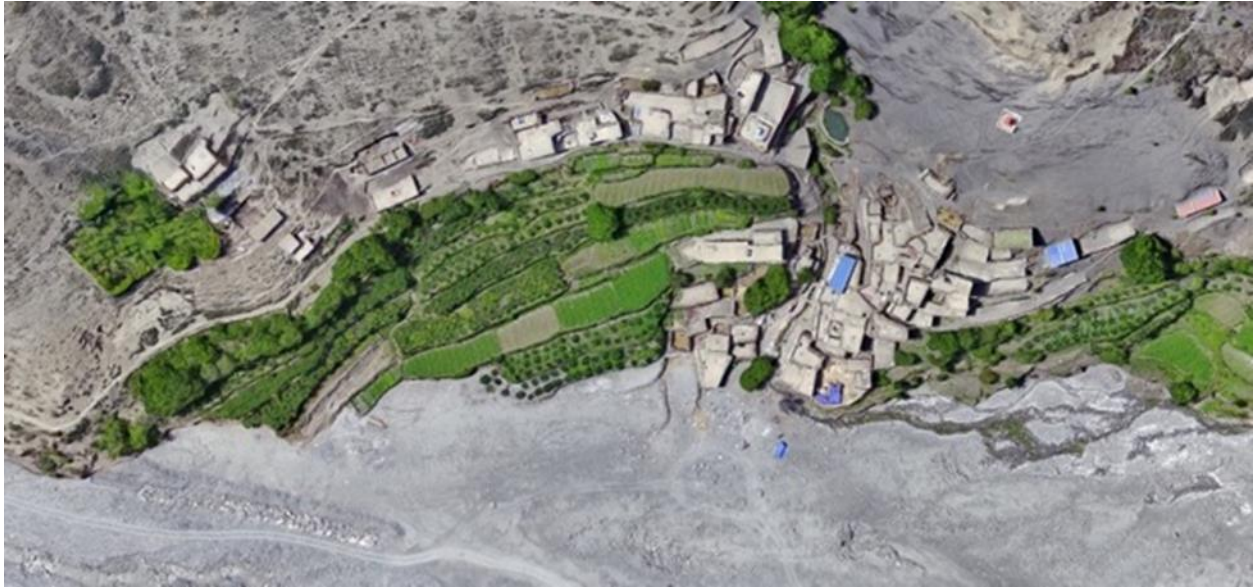
Figure A17: Main Village 2022 – Zoomed Right Aerial View of the 3D Digital Model Representing Lubra Village in 2022