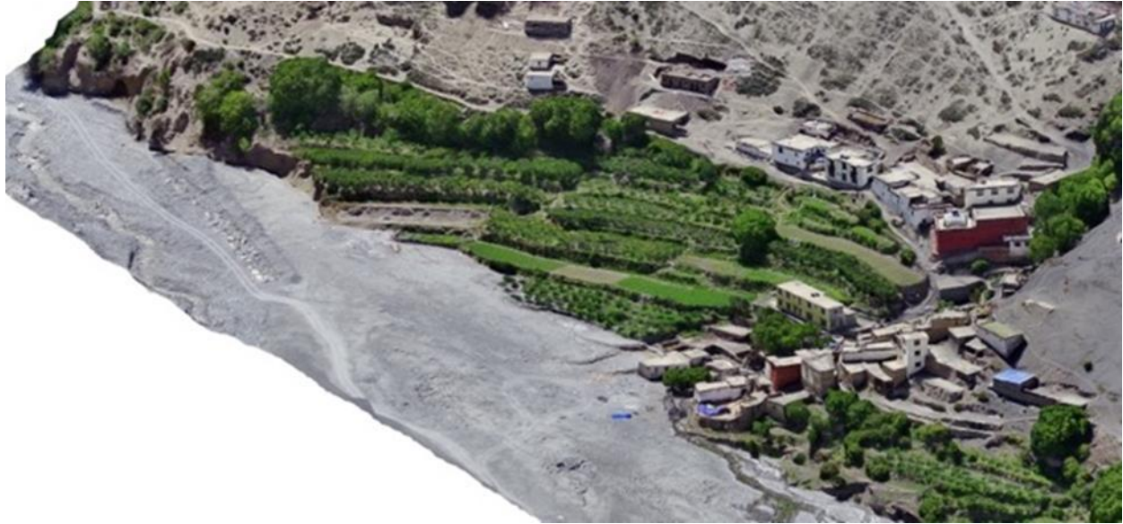
Figure A15: Main Village 2022 – Zoomed Frontal View of the 3D Digital Model Representing Lubra Village in 2022