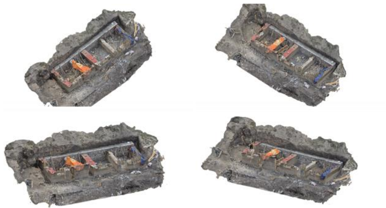
Figure A9: Home Construction: Angled Perspectives from the Back Corners of the 3D Digital Model Representing Co-author Gurung’s Home