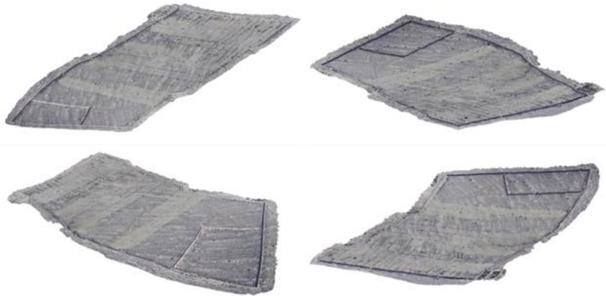
Figure A5: Location B – Zoomed-in Perspectives of the 3D Digital Model Representing Location B