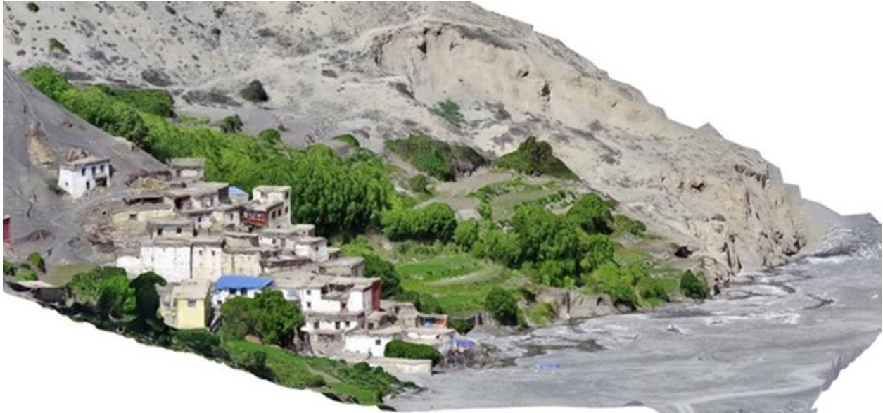
Figure A19: Main Village 2022 – Angled Rear Views of the 3D Digital Model Representing Lubra Village in 2022