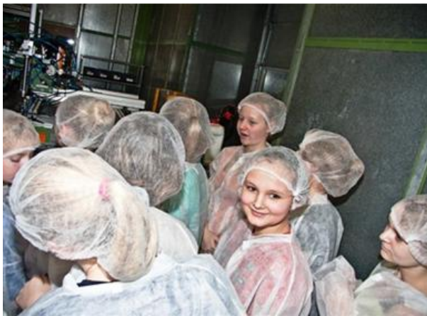
Fig. 1. Example activity

The purpose of the project was, according to the project description, to strengthen the interest of primary and secondary students in the areas of science, technical education, and engineering. This was attempted via combining the teaching in the schools with teaching in a company and/or another educational institution. Thus, it also intended to increase student knowledge regarding possible job opportunities (projektsampil.dk). The project established 16 collaboration cases between educational institutions and businesses. In eight cases, the collaboration was between either a primary school class or a high school class and a company, while another eight cases involved collaboration among all three levels: primary schools, high schools, and a company. Figures 1 and 2 show two examples of teaching courses. The one is a collaboration between primary school and a metal processing company (6. graders in mathematics), and the other one is a collaboration between primary school, VIA UC and a building surveyors company (5.-8. graders geography). The educational processes that were developed are documented in education schemata, videos, teacher instructions, and educational material developed for other teachers who want to implement similar activities.