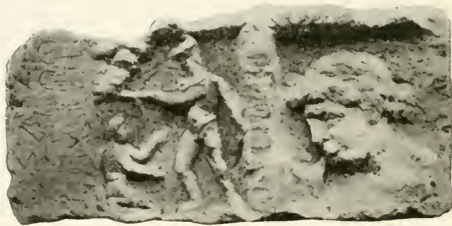
Fig 1. BAS-RELIEF OF MAYENCE.

On the other hand, the orthodox and heretical liturgies of Christianity, which gradually sprang up during the first centuries of our era, could find abundant inspiration in the Mithraic Mysteries, which of all the pagan religions offered the most affinity with Christian institutions. We do not know whether the ritual of the sacraments and the hopes attaching to them suffered alteration through the influence of Mazdean dogmas and practises. Perhaps the custom of invoking the Sun three times each day,—at dawn, at noon, and at dusk,—was reproduced in the daily prayers of the Church, and it appears certain that the commemoration of the Nativity was set for the 25th of December, because it was at the