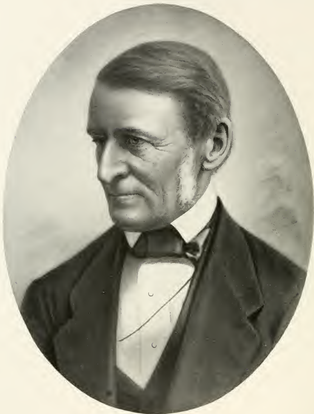
RALPH WALDO EMERSON.

Born May 25th, 1803. Died April 27th, 1882.