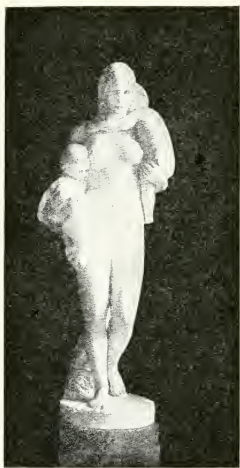
Fig. 20. EVE AND HER CHILDREN. (A marble statue by Adolf Brütt.)

However, these skirmishes, provoked by my opponents, into the realm of the moral level of the two nations involved, seem to me of infinitely less importance than a final observation in connection with the proclamation of the "ethical monotheism" of Israel or of the "spirit of prophetism" as a genuine revelation of the living God," which in my opinion has not yet received fitting attention.