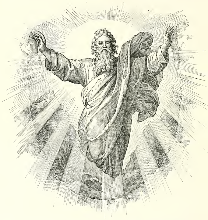
Fig. 18. THE ANCIENT OF DAYS. (After Schnorr von Karolsfeld.)

The prophets of the Old Testament do exactly the same thing, at least in spirit. In perfect agreement with the Babylonians and