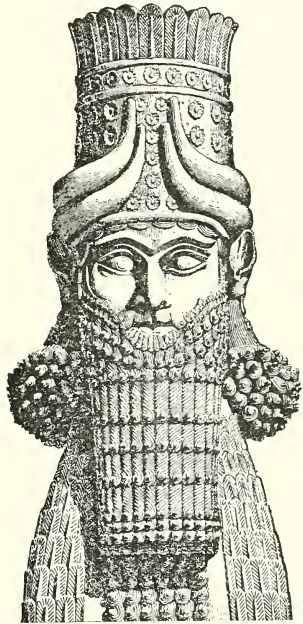
Fig. 17. HORNS THE EMBLEM OF STRENGTH.

It seems to me that exaggerations should be avoided in either direction. I have never ceased to emphasise the "crass" polytheism of the Babylonians, and am far from feeling obliged to disguise it. But I regard it as just as much out of place to make the Sumerian-Babylonian pantheon and its representation in poetry, particularly in popular poetry, the butt of shallow wit and sarcastic exaggerations, as we should properly condemn such ridicule if directed at the gods of Homer. Nor should the worship of divinities in images of wood or stone be in any wise glossed over. Only it should not be forgotten that even the Biblical account of creation has man created "in the likeness of God," in diametrical contradiction of the constantly emphasised "spirituality" of God,—as has rightly been