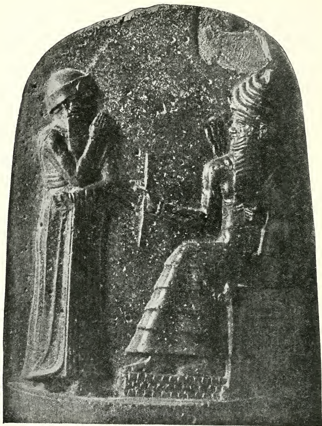
Fig. 16. HAMMURABI BEFORE SHAMASH, THE GOD OF LAW.

and South in his land, has written down these laws, nevertheless he in his turn received them from the highest judge of heaven and earth, the Sun god, the lord of all that is called 'right,' and there-