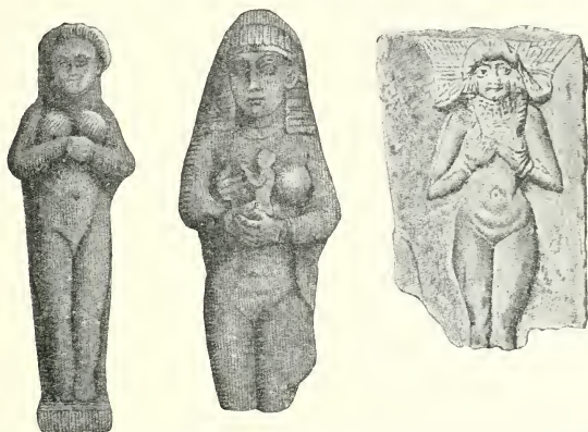
Fig. 19. BABYLONIAN CLAY FIGURES REPRESENTING THE GODDESS OF BIRTH.

And how variously pitched is that instrument, the human temperament! While Koldewey and others with him are astonished anew that the excavations in Babylonia bring to light absolutely no obscene figures, a Catholic Old Testament scholar knows of "numberless statuettes found in Babylon which have no other purpose but to give expression to the lowest and most vulgar sensuality." Thou poor goddess of childbirth, poor goddess Istar! However, although thou be moulded only of clay, yet needst thou not