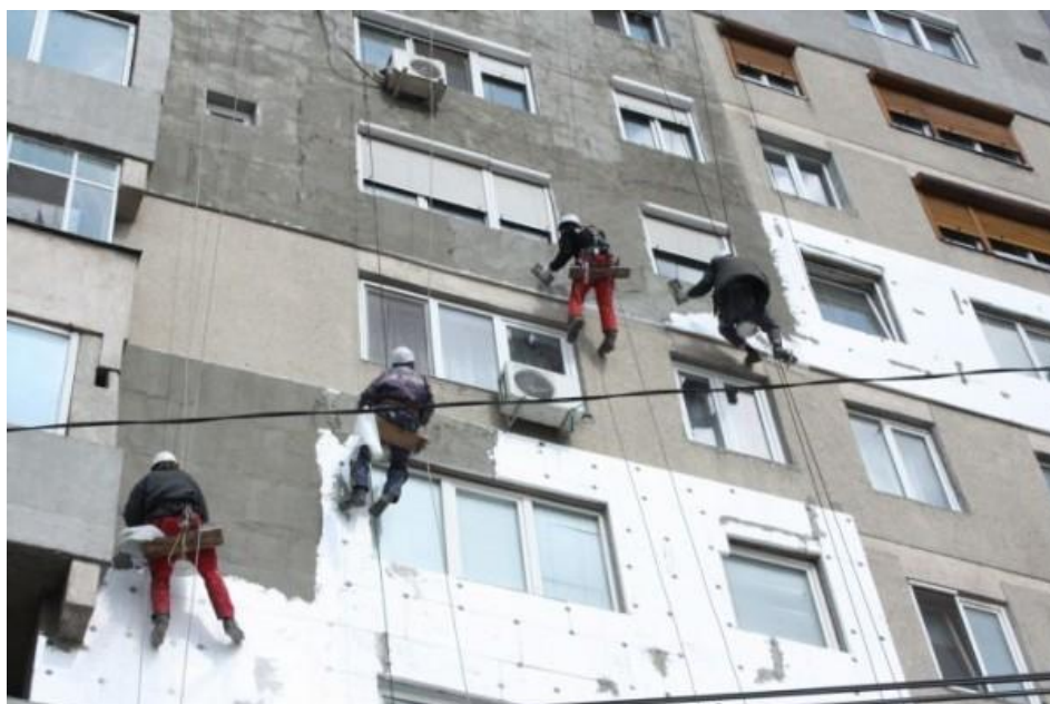
Fig. 2 Retrofitting – blocks of flats

Romania has received the European Commission's approval to finance from European funds the projects for retrofitting of housing blocks. In parallel with the negotiations with the EC, it was necessary to fix the legislation. Thus, the Government approved the new regulations, allowing retrofitting to be made with European financial contribution, supplemented by a share from town halls, as well as a minimum owner's contribution. The new normative act provides for city halls the possibility to take over the financial burden of the owners associations, but with subsequent recovery of amounts within maximum 10 years. The Ordinance also stipulates that blocks to be undergoing retrofitting will be prioritized according to the level of energy performance (starting with the most energy inefficient housing blocks), number of flats (starting with the housing blocks having the highest number of flats) and year of construction (starting with the oldest housing blocks).