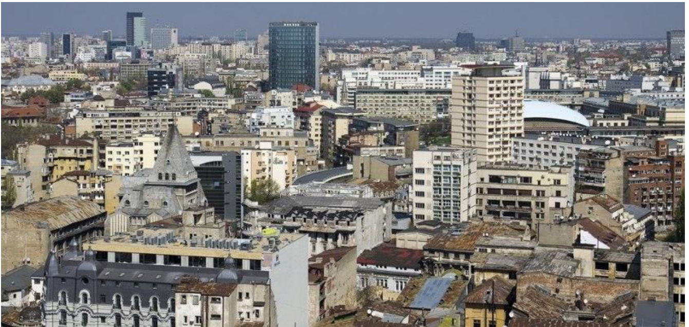
Fig. 1- View over Bucharest

The lack of a clear definition of elements (intervention arrangements in areas with historical monuments, the demarcation of ensembles and sites, the lack of definition regarding “protected built areas” and “historical centres”) and a number of gaps in correlating the existent legislation with related provisions, such as the correlation of law no.5/2000 with the List of Historical Monuments, led to difficulties in applying the law. All these aspects have serious repercussions on how the state, through institutions, acts to punish illegal interventions in these areas. On the other hand, in the application process for the specific legislation, difficulties were faced in establishing the protected areas, starting from the existing inadequacies in regulations. Thus, the monuments can be divided into typological categories as they are mentioned in the Law no.5/2000, typology that doesn't follow closely the established categories from Law no. 422/2001 regarding the protection of historical monuments. In fact, protected built areas, defined as “historic city centres”, which also include new constructions, are included in the List of Historical Monuments in the “assembly” or “sites” categories, producing serious disturbances in the building approval process.