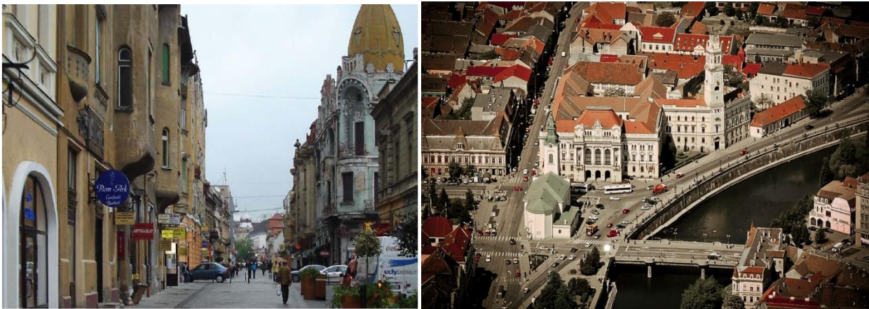
Fig. 3 – Oradea city center

In consequence, the popular technical solution for rehabilitation in Romania - the use of insulation material on the facade is excluded.