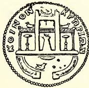
COINS OF PAPHOS