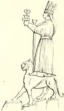
GODDESS ON A LIONESS From a rock-carving at Boghaz-Koi.

"Quid referam ut volitet crebras intacta per urbes Alba Palaestino sancta columba Syro?" 33