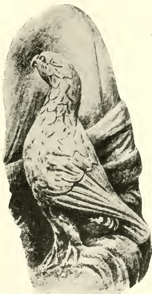
ASTARTE'S DOVE (DETAIL)

ism worshiped personal divinities especially. The character of the gods that were originally adored by the Semitic tribes has been ingeniously reconstructed. 38 Each tribe had its Baal and Baalat who protected it and whom only its members were permitted to worship. The name of Ba'al , "master," summarizes the conception people had