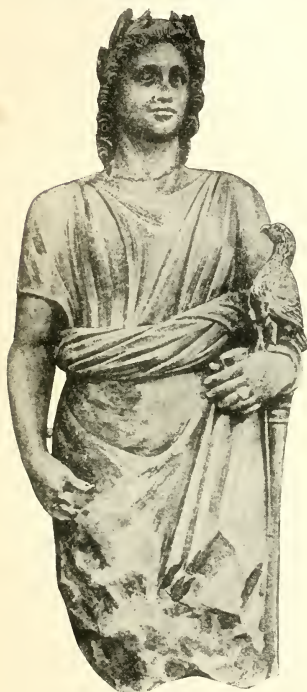
ASTARTE AND THE DOVE

However, over this lower and primordial stratum that still cropped out here and there, other less rudimentary beliefs had formed. Besides inanimate objects and animals, the Syrian pagan-