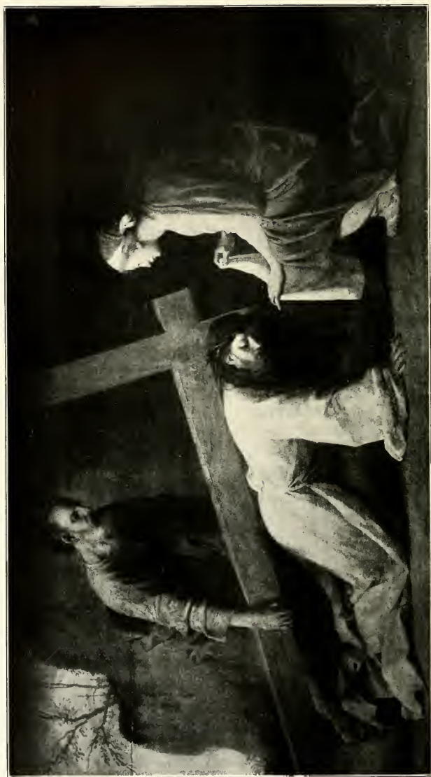
VERONICA. BY EUSTACHE LE SUEUR (1617-1655).