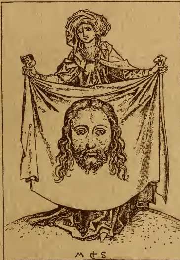
ST. VERONICA. By Schongauer. (See pages 650 ff.)

The Open Court Publishing Company CHICAGO