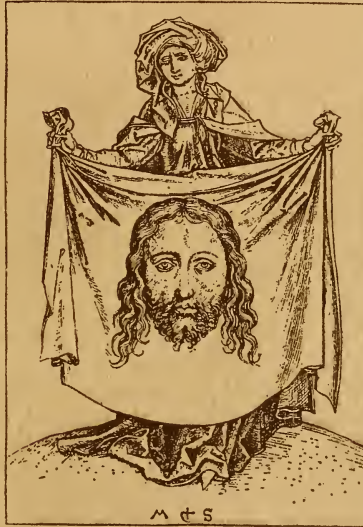
St. VERONICA. By Schongauer. (See pages 650 ff.)

The Open Court Publishing Company CHICAGO