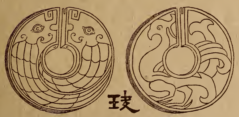
AN OPEN JADE RING; CHINESE SYMBOL OF SEPARATION. (See pages 673-675.)