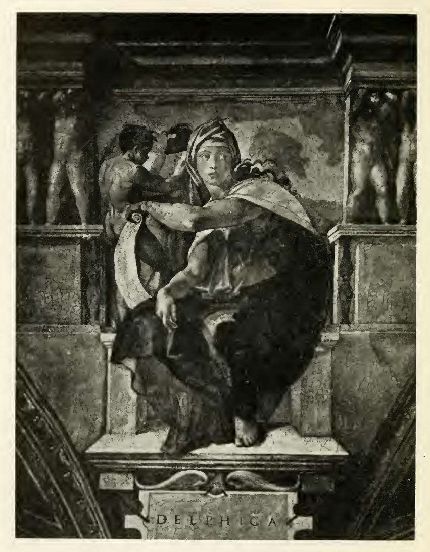
PYTHIA, THE DELPHIC ORACLE.*

source of inspiration, viz., in the literature of heathendom. To the modern church there is something repugnant about this notion, and