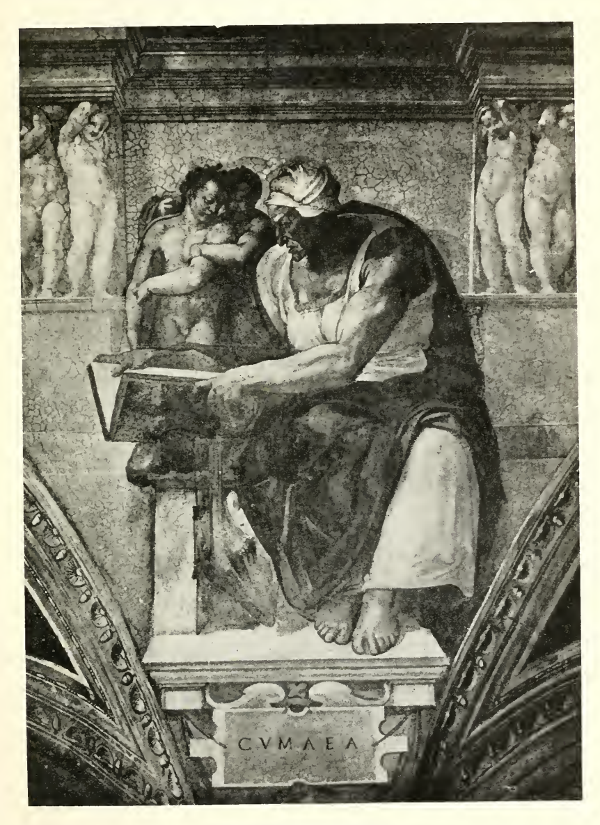
THE CUMAEAN SIBYL.

of the old Hansa town keep her in a small bottle that hangs on a column in the high church at Lübeck. Once a year she stirs and