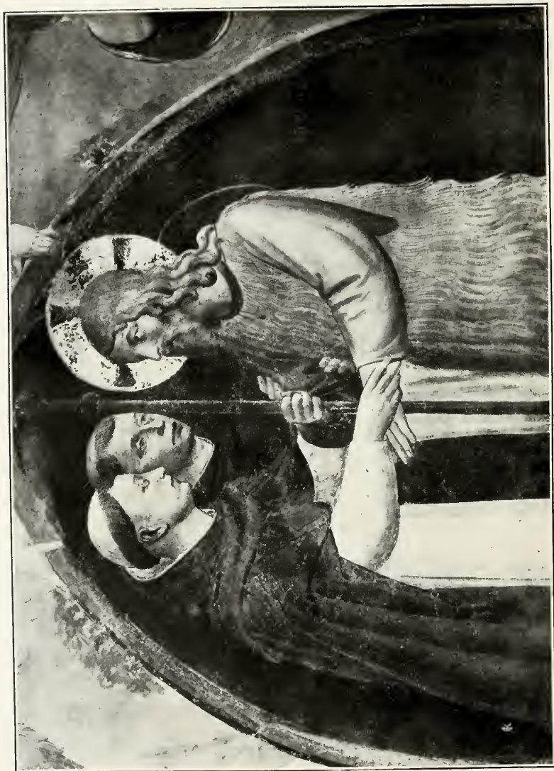
CHRIST AS A PILGRIM.