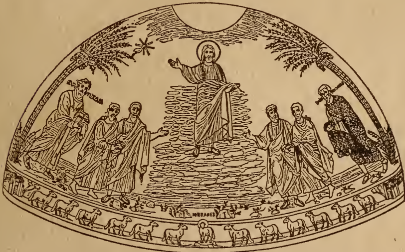
MOSAIC IN THE CHURCH OF SS. COSMAS AND DAMIAN AT ROME.