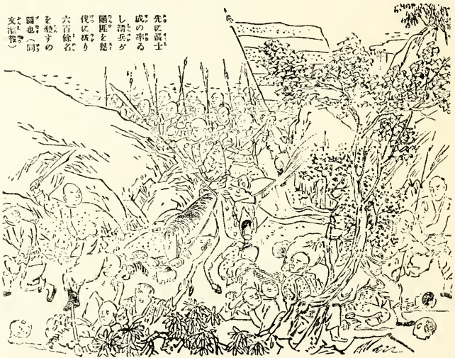
CHINESE IMPERIAL TROOPS PURSUING AND SLAYING BOXERS.

foreigners and all things foreign from China and the restoration of the Empire to its former position of exclusion and self-sufficiency. Its animus is peculiarly strong against foreign religions, not only because the missionary pervades the whole interior of the country, nor yet because his converts are now, for the first time, becoming a body respectable by its numbers and thoroughly imbued with sentiments earnestly desirous of foreign intercourse and innovation, but also because its leaders, by a true instinct, divine that religion is the great transforming force which, once permitted to permeate