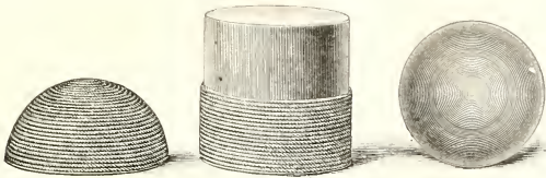
EXPERIMENTAL COMPARISON OF THE SURFACE OF A SPHERE AND THE LATERAL SURFACE OF THE CIRCUMSCRIBING CYLINDER.