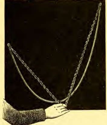
THE CATENARY, OR CURVE FORMED BY A HANGING CHAIN.

The center of gravity of the entire mass tends to seek its lowest possible point, a physical fact by which the mathematical peculiarities of the curve are determined.