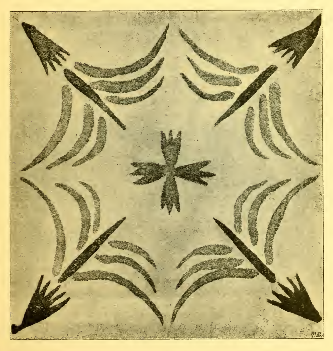
ELEMENTARY BRUSHWORK. "Alma" School, Bermondsey, London, S. E. Age, 8 years.

"There are two kinds of brush lines in Greek art—namely, broad bands all round the vases, and freehand patterns. The bands seem to have been made mechanically. They may have been made by holding or fixing the brush steadily in one place while the vase revolved, as a chisel is worked at a lathe, and as the hand