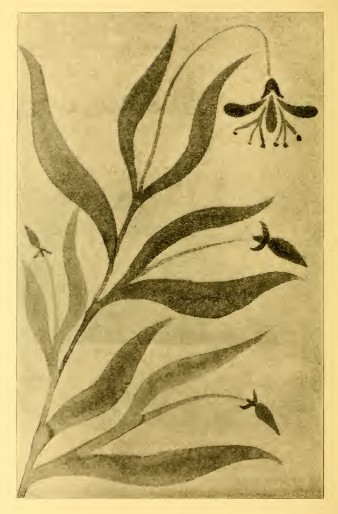
ELEMENTARY BRUSHWORK. "Alma" School, Bermondsey, London, S. E. Age, 9 years.