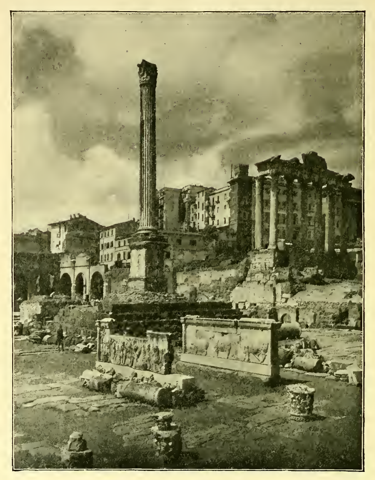
The Column of Phocas in the Forum (608 A. D.). Remains of the Temple of Saturn in the Background to the Right.<sup>1</sup>

of the ancient houses thus destroyed were scattered and left where they had been destroyed. This was especially so when the enormous public baths of the empire were built, and when the older buildings were simply buried. And just as we use the materials of our old houses to build our new ones, not thinking of the æsthetic loss involved in the utilisation of old boards and brick, so also did the Romans, only with this exception, that their materials were different.