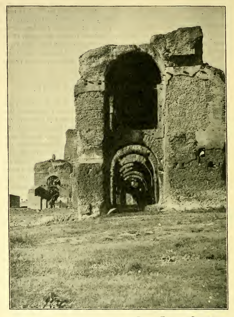
SUBSTRUCTURES OF THE PALACE OF THE ROMAN EMPEROR SEPTIMIUS SEVERUS (146-211 A. D.). (From Lanciani's Destruction of Ancient Rome.)

feet long; and each capital 6 feet high and 14 feet in circumference! So also the great marble and stone theaters of Balbus and Pompey, the great stadia and odea, with their enormous seating capacities, have all disappeared, leaving not a rack behind. Of the great villa of the Emperor Gordianus, two and one-half miles