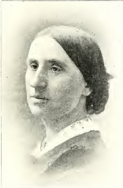
DR. MARIE E. ZAKRZEWSKA.

thought of myself! Oh, no! It was just as much in me to provide liberally for my tastes, for my wishes, for my needs. I had about as many egotistical wants to be supplied as the average of mankind. To look out for self, for those necessary to my happiness, I always considered not a pleasure only, but a duty. I despised the weakness of characters who could not say 'no' at any time, and thus gave away and sacrificed all their strength of body and mind, as well as their money, with that soft sentimentality which finds assurance in the belief that others will take care of them as they have taken care of others.