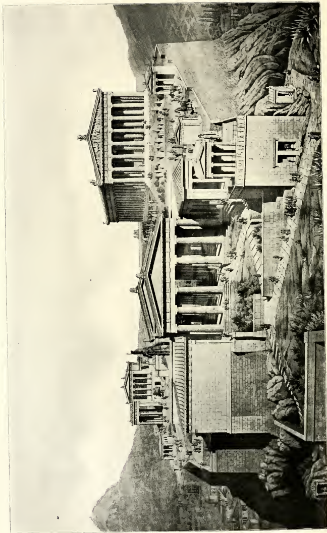
ACROPOLIS OF ATHENS — RECONSTRUCTED.