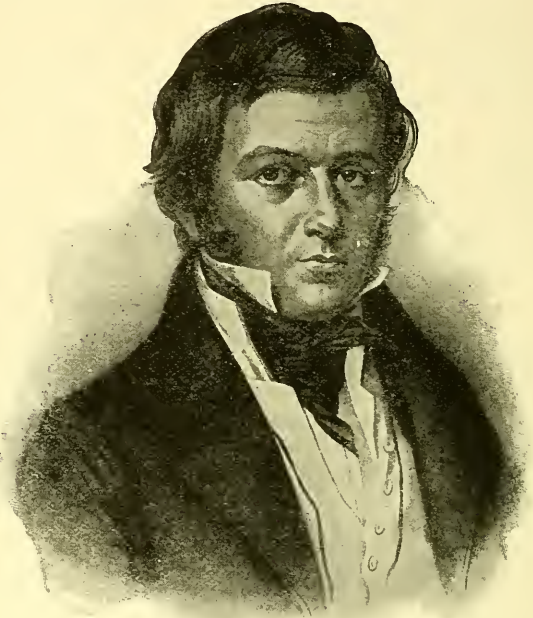
VICTOR COUSIN. (1792-1867.) From the Philosophical Portrait Series (reduced).