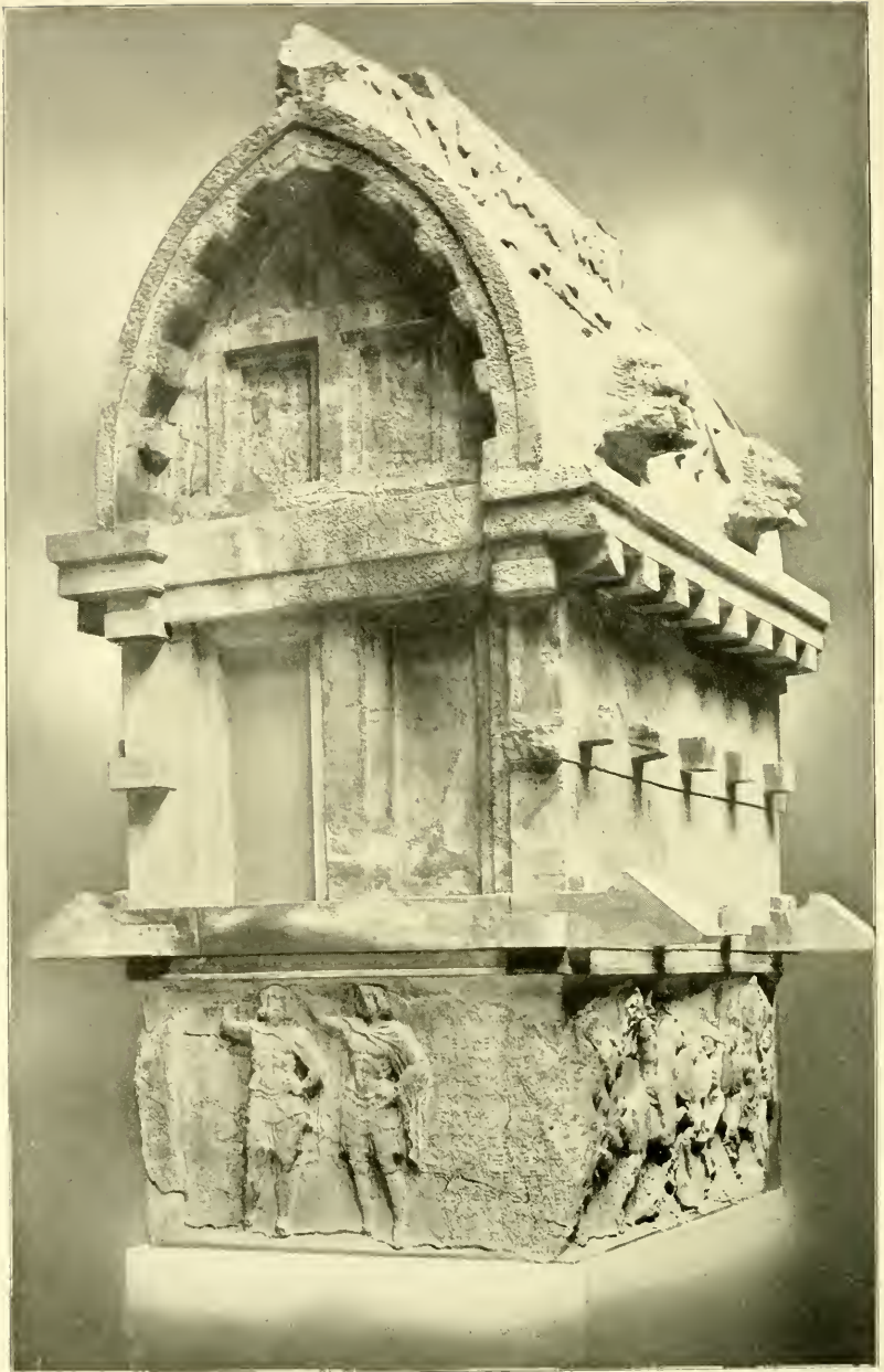
MONUMENTAL TOMB OF ASIA MINOR.

(After a photograph of the tomb in its present condition.)