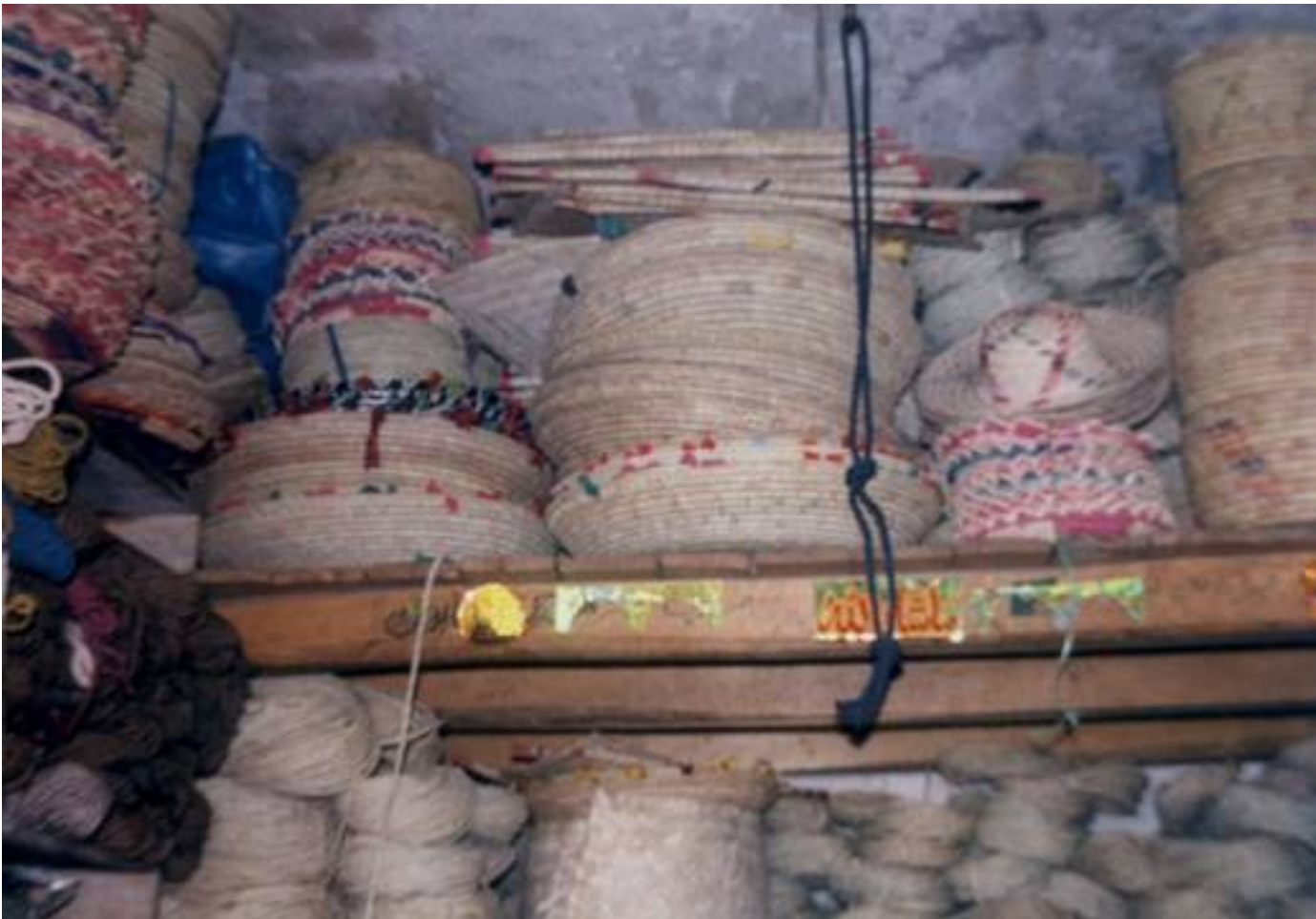
Fig. 2. Some products made from mazri palm.