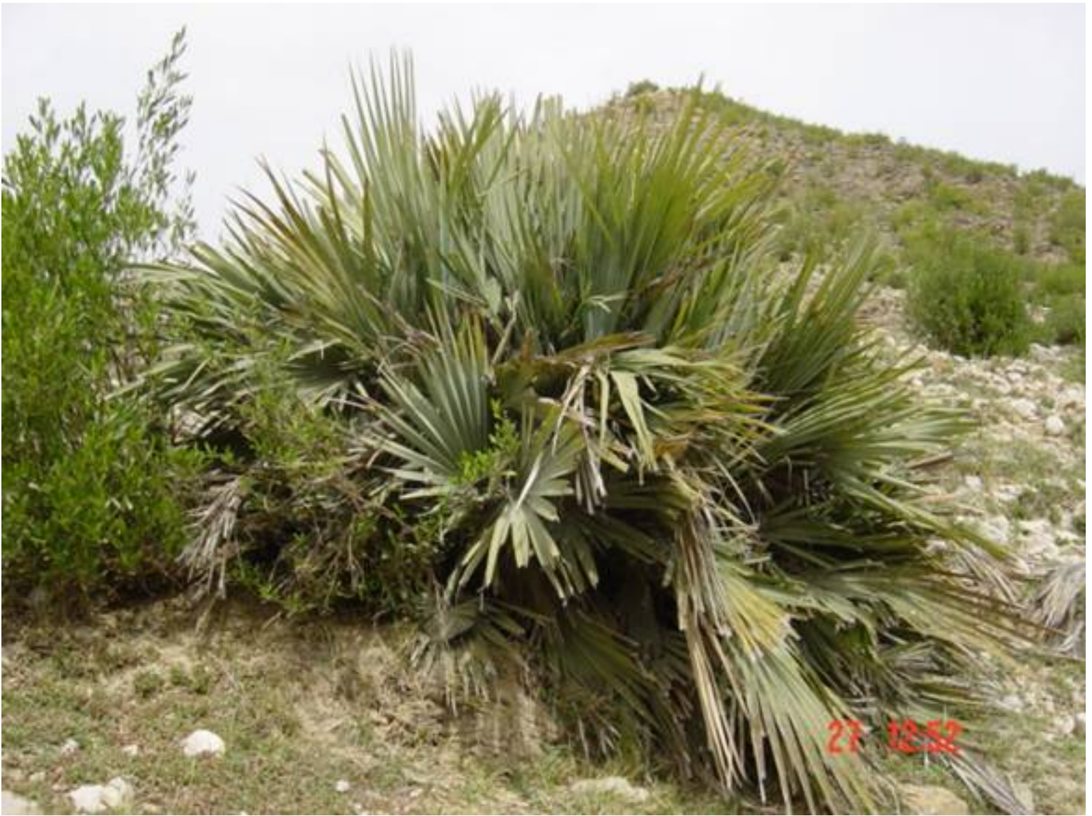
Fig. 1. Mazri Palm.

Mazri is found in the wild while in patches, it is also cultivated. About 65,000 people are involved in processing of Mazri leaves- 78% of them are women. The women are doing most of the job starting from harvesting to finished products. Men and women with the help of sickle harvest the Mazri from the growing areas from October to April. Both fresh and dried leaves are used for products making. One leaf yields about 30 to 40 pieces and 5 kg of leaves produces about 4 kg of products with waste of 20% (Iqbal, 1991). Average annual production of raw Mazri leaves in the country is 37,315 tones. It has been estimated that an average worker can process more than 0.5 tones of raw Mazri leaves per year (Iqbal, 1991). Baluchistan is the biggest producer of the Mazri in Pakistan with average annual production 27,265 tonnes. Mazri leaves are distributed in various