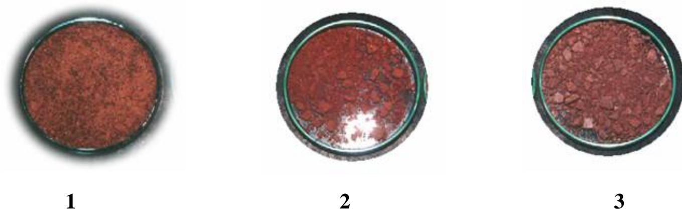
Figure 1. Phytohormones (Saponin) extracted from seed of Foeniculum Vulgare .

of flavonoids and fat. Whereas the level of saponins, protein, amino acids and other organic compounds were high in seeds. (Tables 1-6 and Figs 1-2) . The seeds of Foeniculum are considered as essential ingredients for many local medicines those can used against stomach, kidney and liver infection and disorders. (Etherton, 2002: Matin et al. 2002). The organic compounds obtained from seeds will further increase the market values of these valuable medicinal plants. The younger and fresh leaves are consider as delicious and traditional vegetables in many areas of this region (Karnick,1998) . Furthermore Seeds (fruits) are being use in all most all of houses of this region for many purposes of human population, whereas leaves are mostly used as vegetables either cooked or in the form of salad.( Zaidi,1998 )