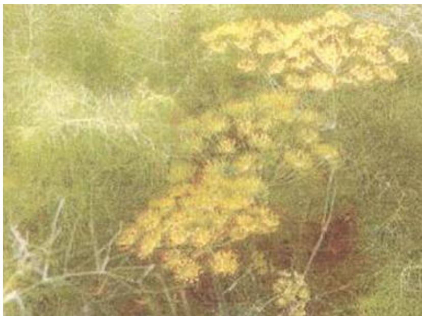
Foeniculum vulgare in the flowering season

Furthermore all chemicals used in this study were analytical grade (Sigma and Merck ) and were imported from abroad.