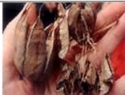
Aristolochia indica L.