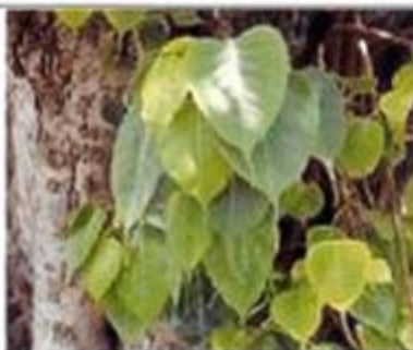
Ficus religiosa L.