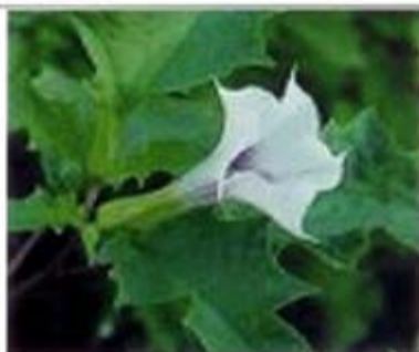
Datura stramonium L.