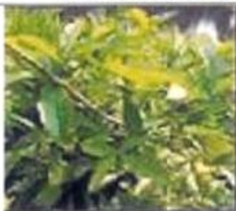
Alangium salvifolium Wang.