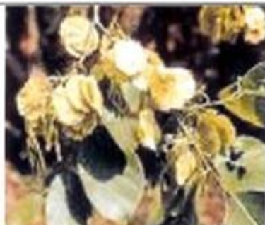
Holoptelia integrifolia (Roxb.) Planch.