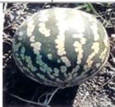
Citrullus colocynthis (L.) Sehr.