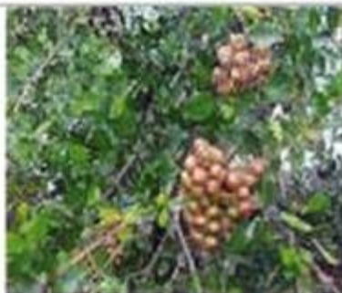
Lawsonia inermis L.