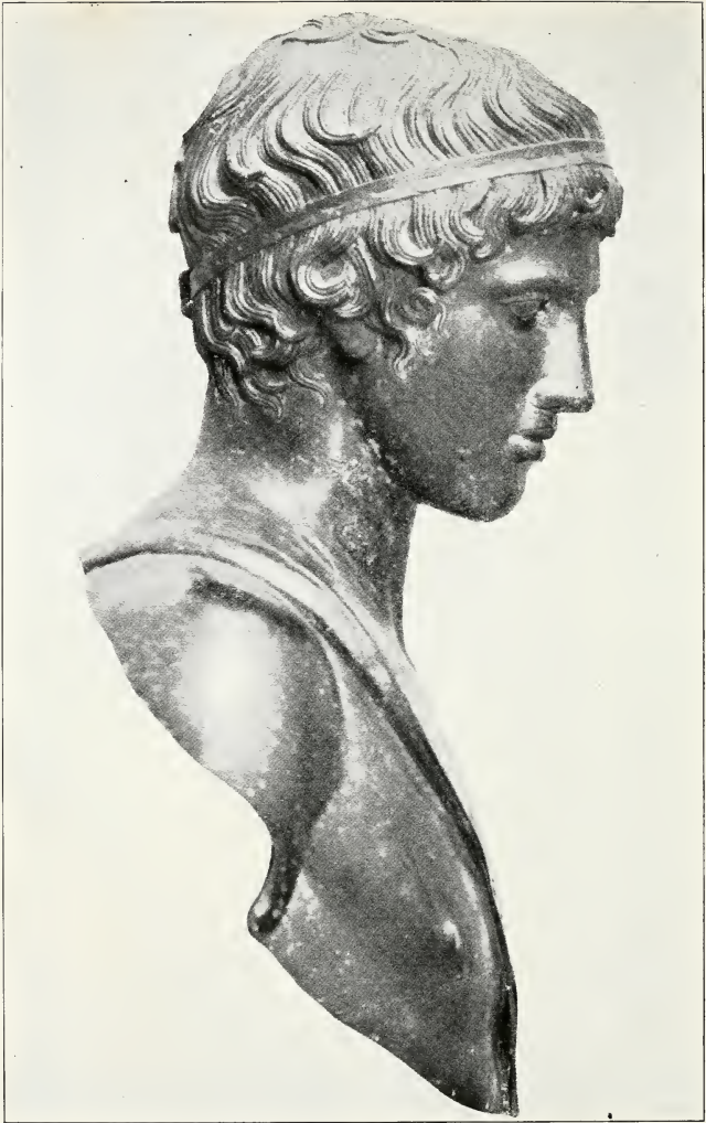
HEAD OF BOY WITH VICTOR'S HEAD BAND. Bronze of the latter part of fifth century B. C. Now in Munich.